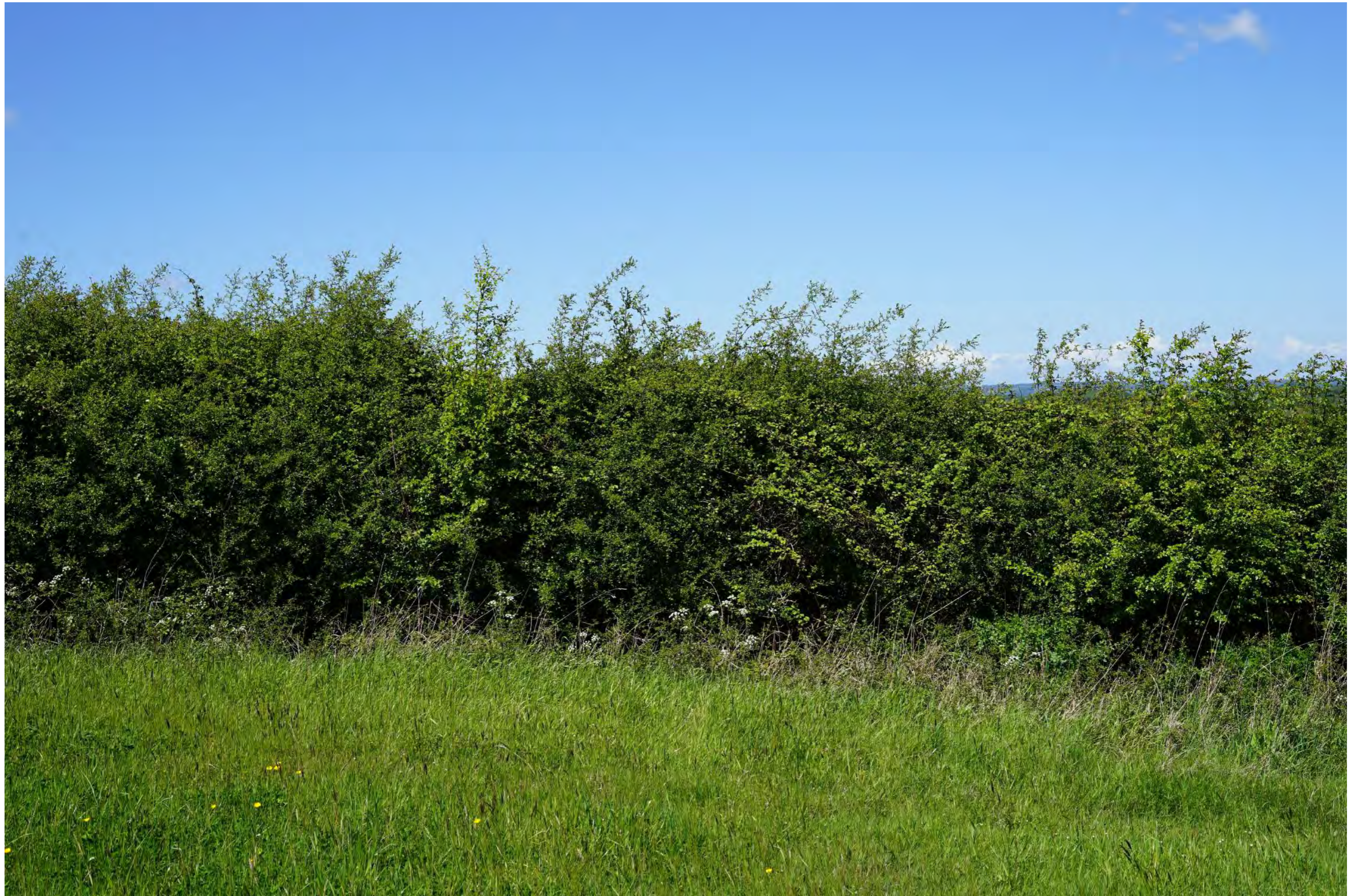
Photograph 21.2 Summer | Viewing distance at A3: 542mm | Horizontal field of view: 39.6° | Direction of view: North-east Camera: Sony ILCE-7 FFS | Lens: Sony FE 50mm F1.8 | Camera height: 1.5m AGL | Date taken: 19/05/2021 | Aperture: 10.0 | ISO speed: 100 | Shutter: 1/160 sec