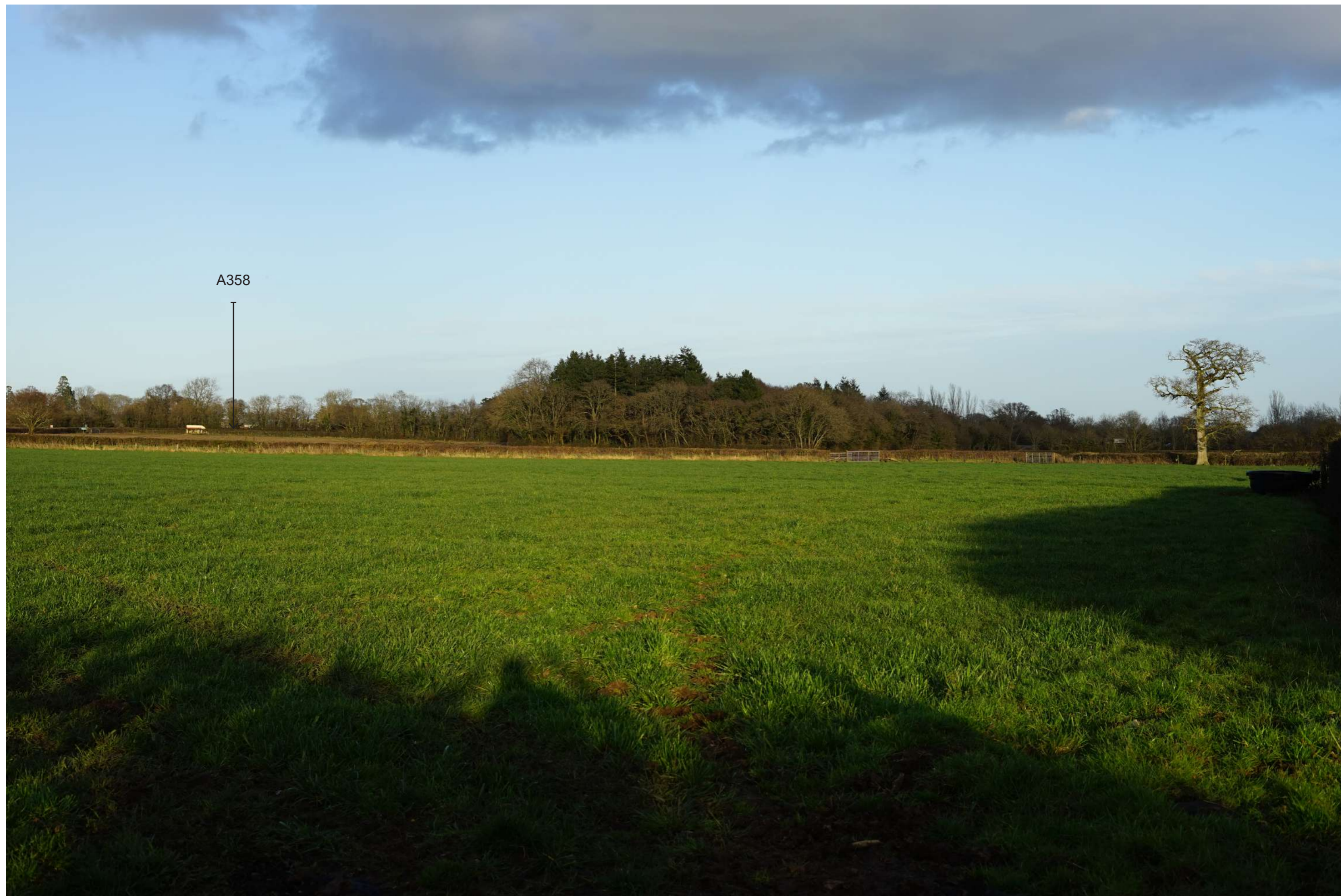
Photograph 14.1 Winter | Viewing distance at A3: 542mm | Horizontal field of view: 39.6° | Direction of view: North-east Camera: Sony ILCE-7 FFS | Lens: Sony FE 50mm F1.8 | Camera height: 1.5m AGL | Date taken: 25/02/2021 | Aperture: 8.0 | ISO speed: 100 | Shutter: 1/125 sec