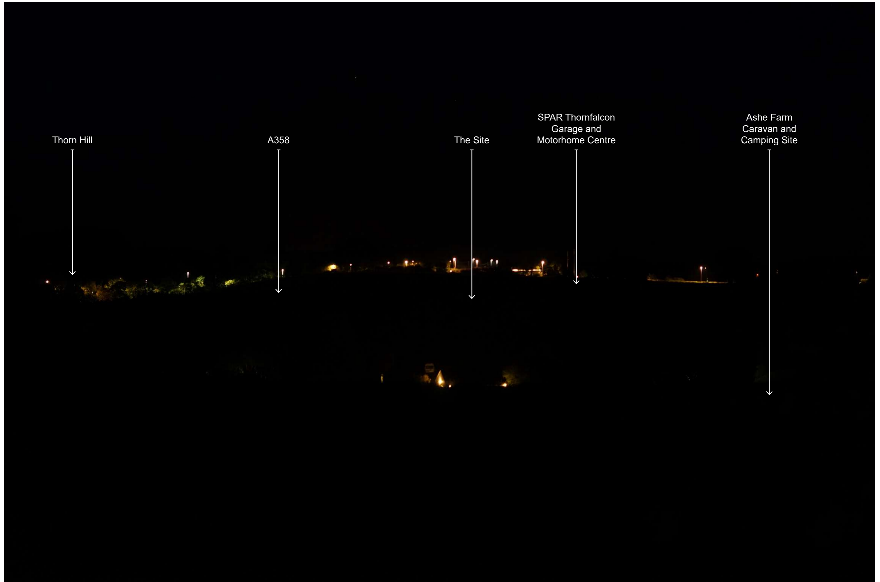
Photograph 7.6 Summer night | Viewing distance at A3: 542mm | Horizontal field of view: 39.6° | Direction of view: North-east Camera: Sony ILCE-7 FFS | Lens: Sony FE 50mm F1.8 | Camera height: 1.5m AGL | Date taken: 02/03/2021 | Aperture: 2.8 | ISO speed: 1600 | Shutter: 1/10 sec