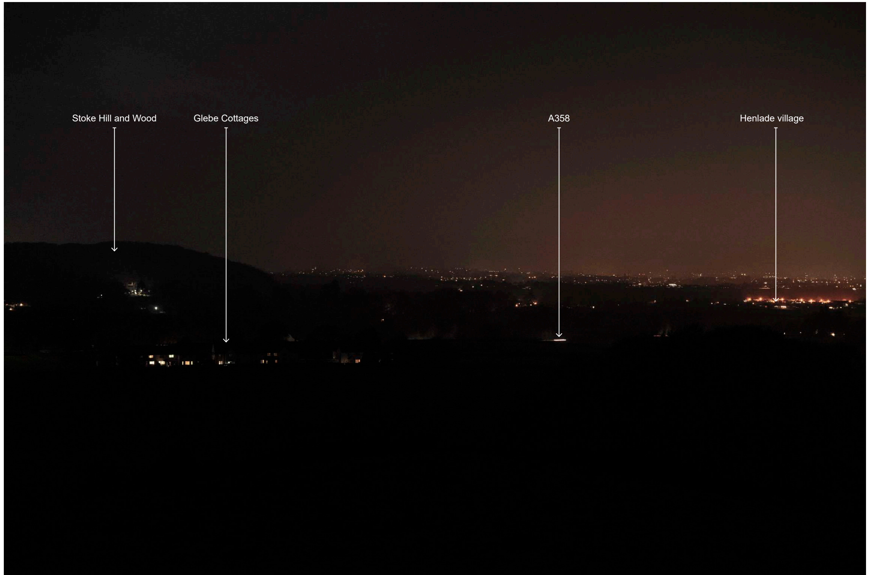
Photograph 5.3 Winter night | Viewing distance at A3: 542mm | Horizontal field of view: 39.6° | Direction of view: West Camera: Sony ILCE-7 FFS | Lens: Sony FE 50mm F1.8 | Camera height: 1.5m AGL | Date taken: 02/03/2021 | Aperture: 2.8 | ISO speed: 1600 | Shutter: 1/2 sec