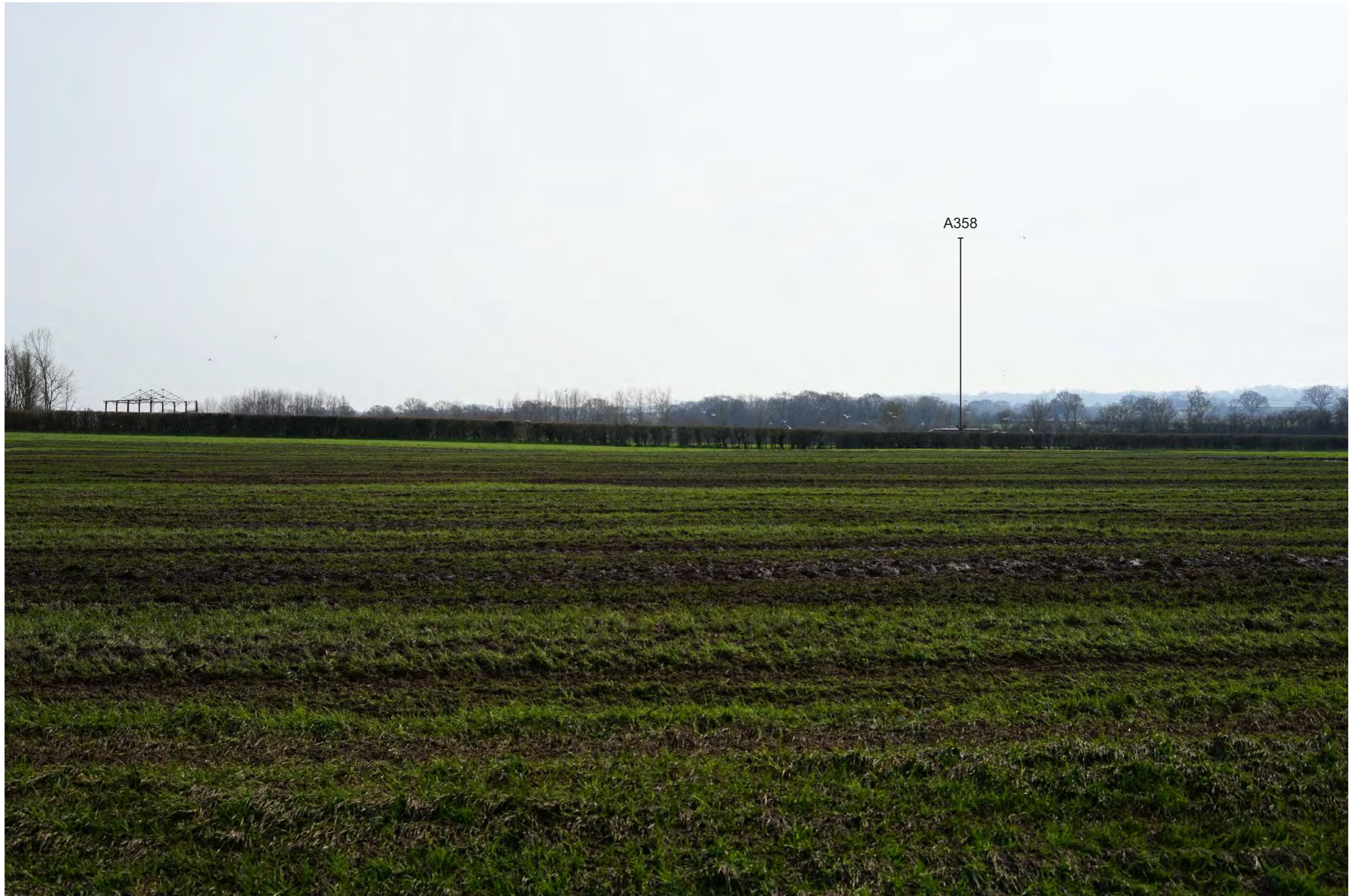
Photograph 13.1 Winter | Viewing distance at A3: 542mm | Horizontal field of view: 39.6° | Direction of view: South Camera: Sony ILCE-7 FFS | Lens: Sony FE 50mm F1.8 | Camera height: 1.5m AGL | Date taken: 09/03/2021 | Aperture: 10.0 | ISO speed: 100 | Shutter: 1/160 sec