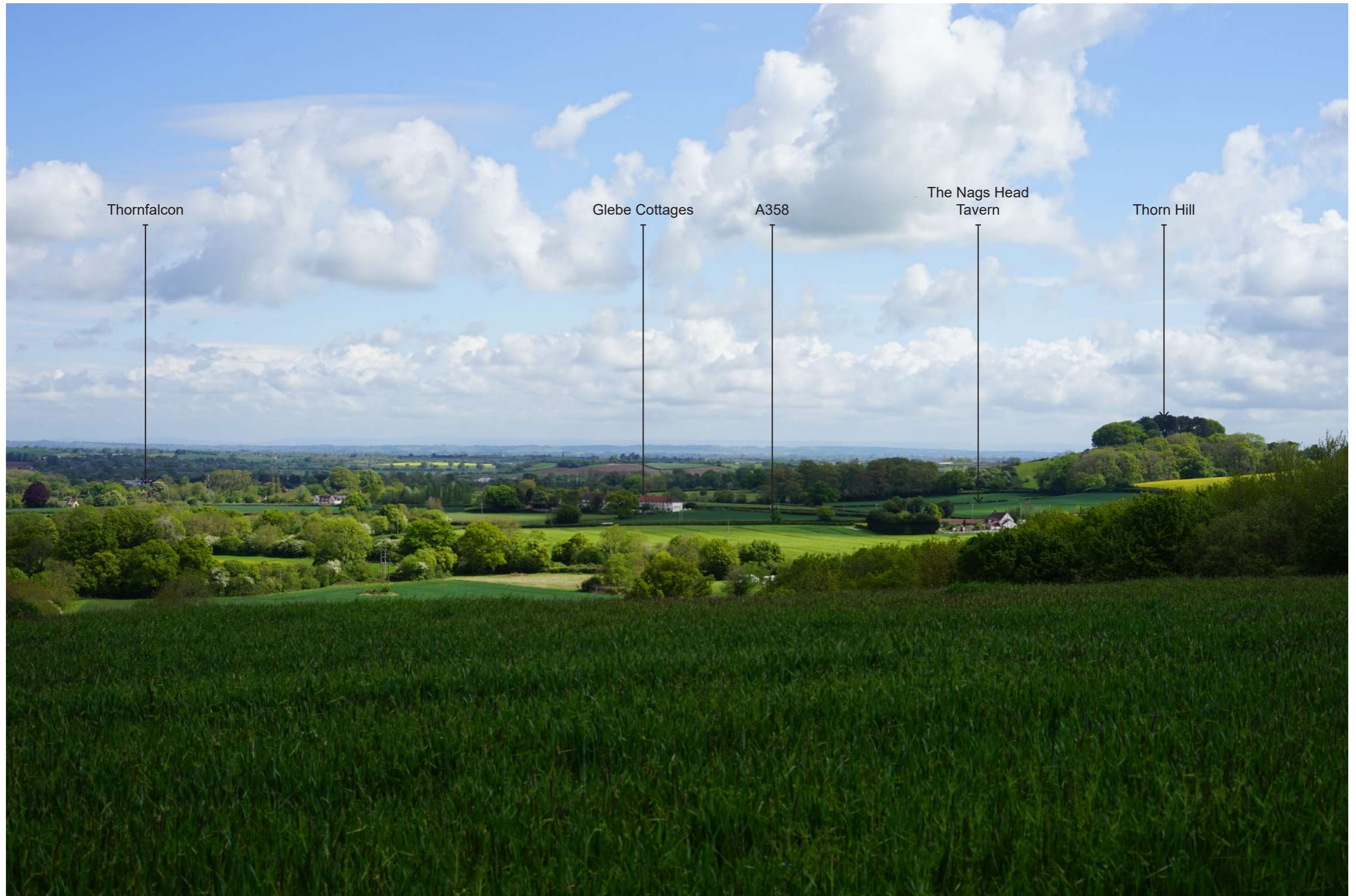
Photograph 6.2 Summer | Viewing distance at A3: 542mm | Horizontal field of view: 39.6° | Direction of view: North-east Camera: Sony ILCE-7 FFS | Lens: Sony FE 50mm F1.8 | Camera height: 1.5m AGL | Date taken: 17/05/2021 | Aperture: 10.0 | ISO speed: 100 | Shutter: 1/160 sec