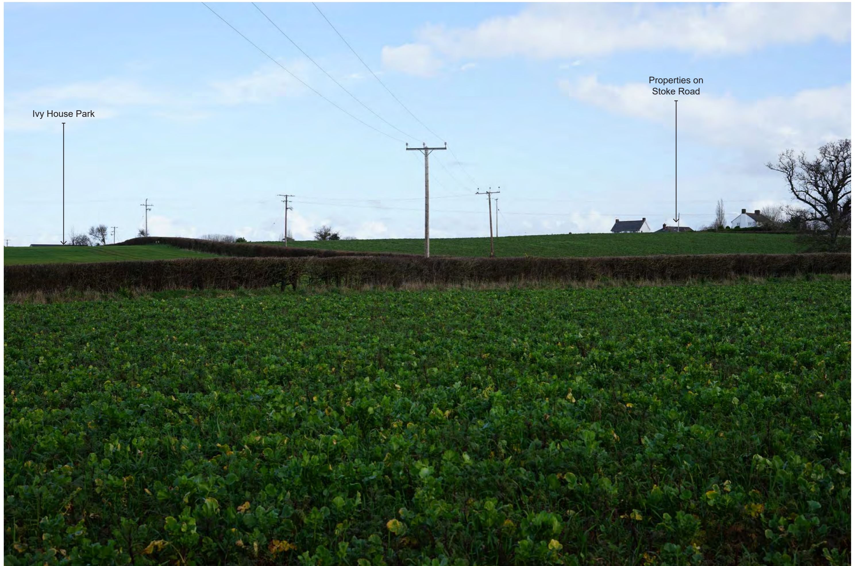
Photograph 1.1 Winter | Viewing distance at A3: 542mm | Horizontal field of view: 39.6° | Direction of view: North-east Camera: Sony ILCE-7 FFS | Lens: Sony FE 50mm F1.8 | Camera height: 1.5m AGL | Date taken: 25/02/2021 | Aperture: 9.0 | ISO speed: 100 | Shutter: 1/125 sec