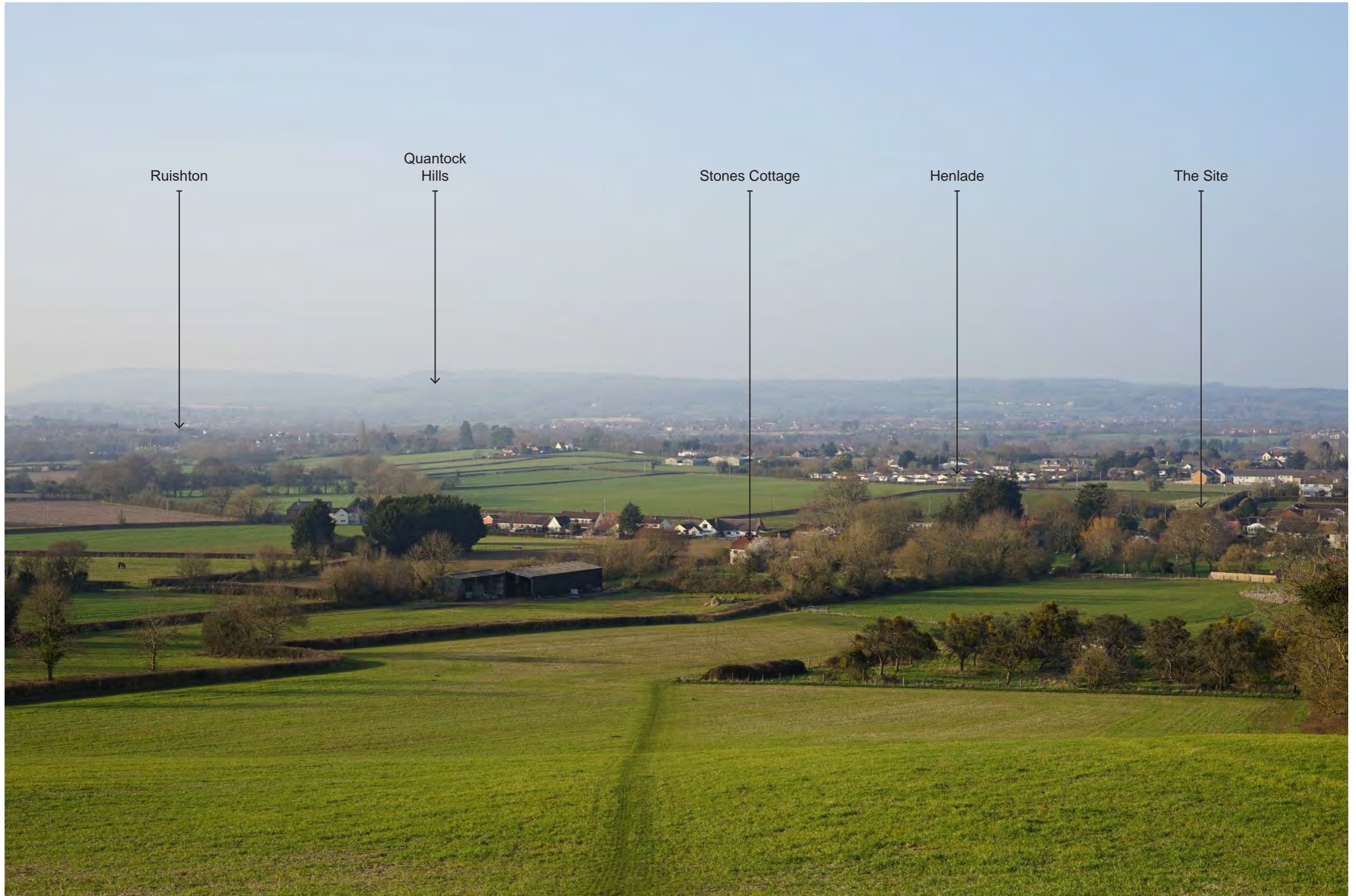
Photograph 2.1 Winter | Viewing distance at A3: 542mm | Horizontal field of view: 39.6° | Direction of view: North-west Camera: Sony ILCE-7 FFS | Lens: Sony FE 50mm F1.8 | Camera height: 1.5m AGL | Date taken: 01/03/2021 | Aperture: 8.0 | ISO speed: 100 | Shutter: 1/125 sec