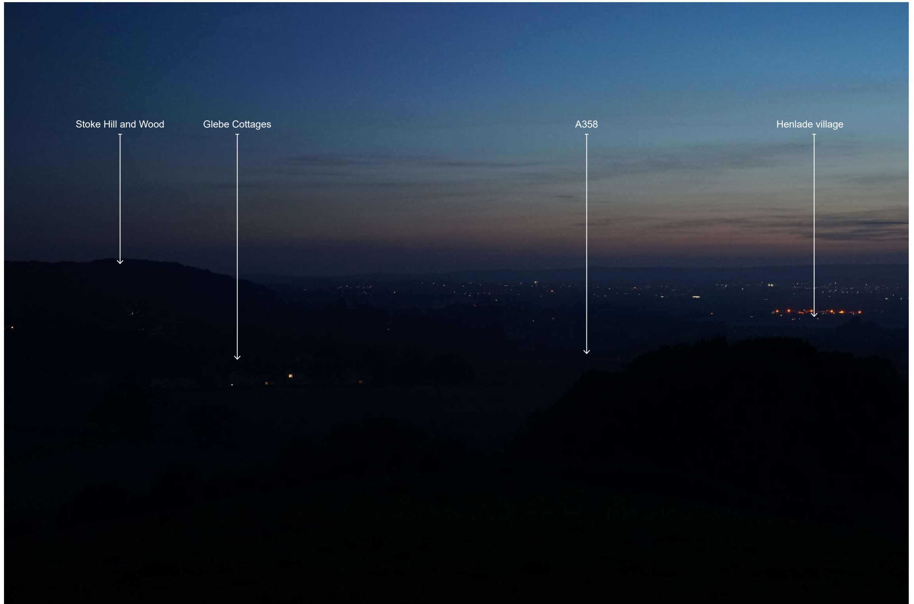
Photograph 5.4 Summer night | Viewing distance at A3: 542mm | Horizontal field of view: 39.6° | Direction of view: West Camera: Sony ILCE-7 FFS | Lens: Sony FE 50mm F1.8 | Camera height: 1.5m AGL | Date taken: 02/03/2021 | Aperture: 2.8 | ISO speed: 1600 | Shutter: 1/2 sec