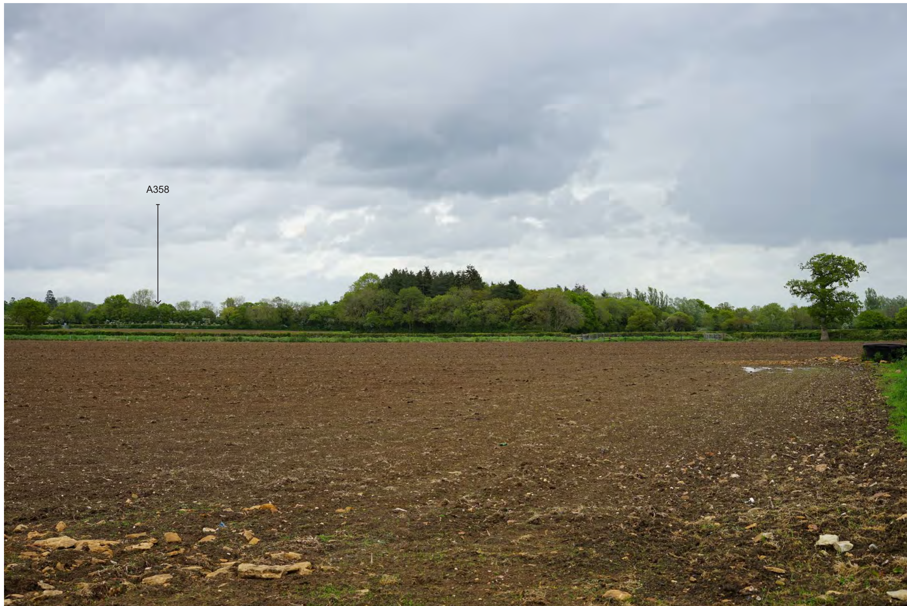
Photograph 14.2 Summer | Viewing distance at A3: 542mm | Horizontal field of view: 39.6° | Direction of view: North-east Camera: Sony ILCE-7 FFS | Lens: Sony FE 50mm F1.8 | Camera height: 1.5m AGL | Date taken: 18/05/2021 | Aperture: 8.0 | ISO speed: 100 | Shutter: 1/125 sec