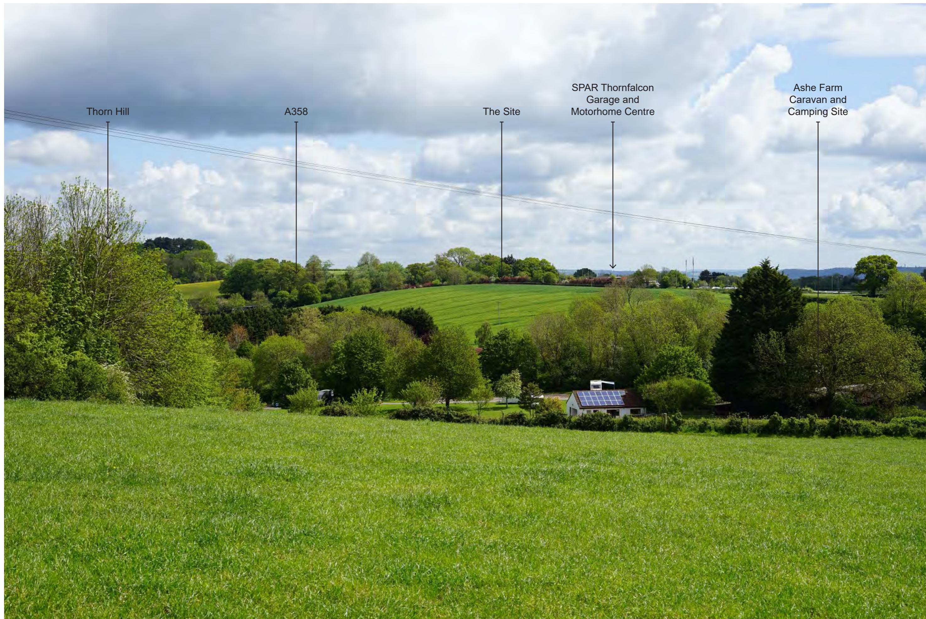
Photograph 7.2 Summer | Viewing distance at A3: 542mm | Horizontal field of view: 39.6° | Direction of view: North-east Camera: Sony ILCE-7 FFS | Lens: Sony FE 50mm F1.8 | Camera height: 1.5m AGL | Date taken: 17/05/2021 | Aperture: 10.0 | ISO speed: 100 | Shutter: 1/160 sec