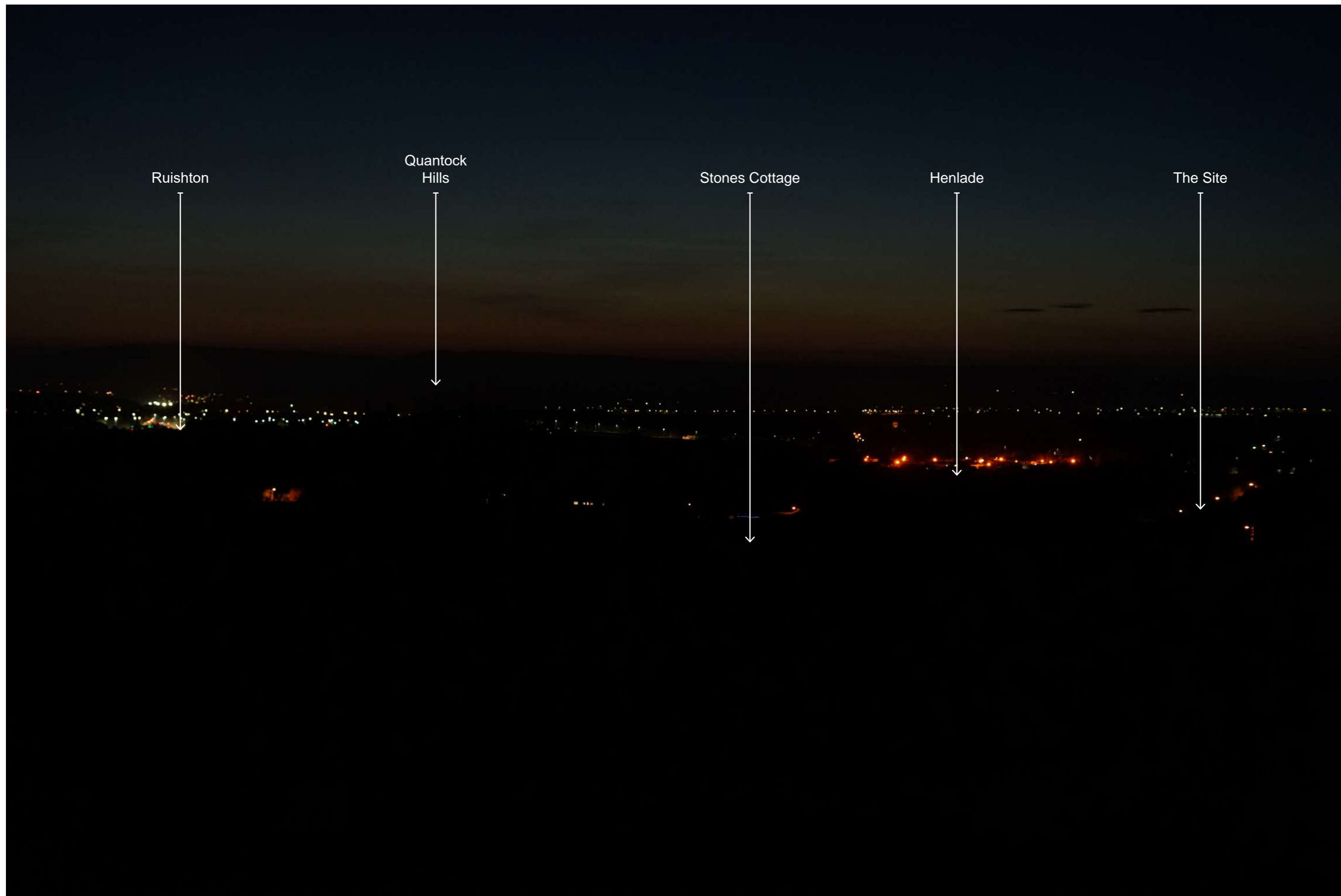
Photograph 2.4 Summer night | Viewing distance at A3: 542mm | Horizontal field of view: 39.6° | Direction of view: North-west Camera: Sony ILCE-7 FFS | Lens: Sony FE 50mm F1.8 | Camera height: 1.5m AGL | Date taken: 02/03/2021 | Aperture: 2.8 | ISO speed: 1600 | Shutter: 1/10 sec