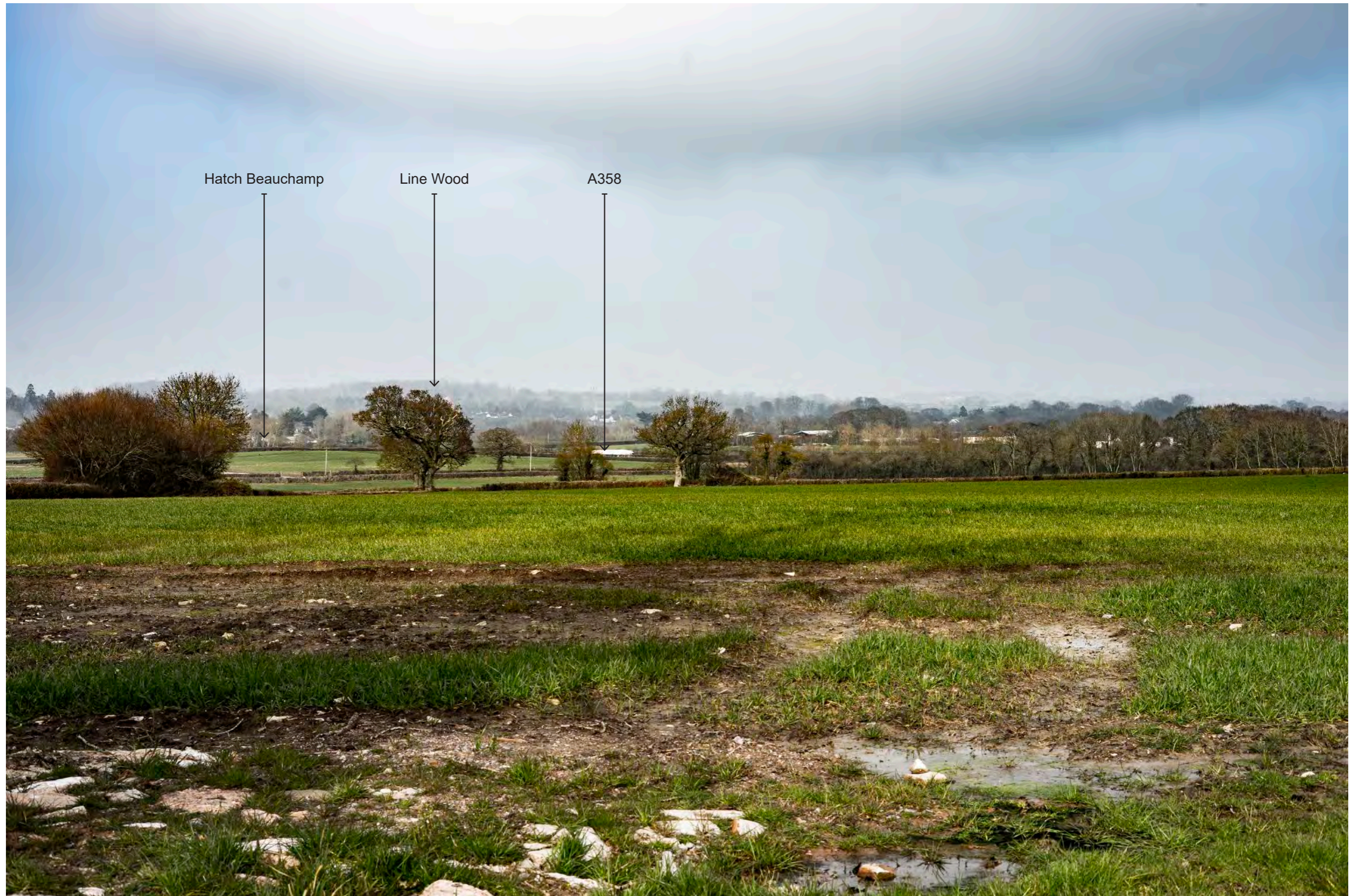
Photograph 19.1 Winter | Viewing distance at A3: 542mm | Horizontal field of view: 39.6° | Direction of view: North-east Camera: Sony ILCE-7 FFS | Lens: Sony FE 50mm F1.8 | Camera height: 1.5m AGL | Date taken: 02/03/2021 | Aperture: 9.0 | ISO speed: 100 | Shutter: 1/125 sec