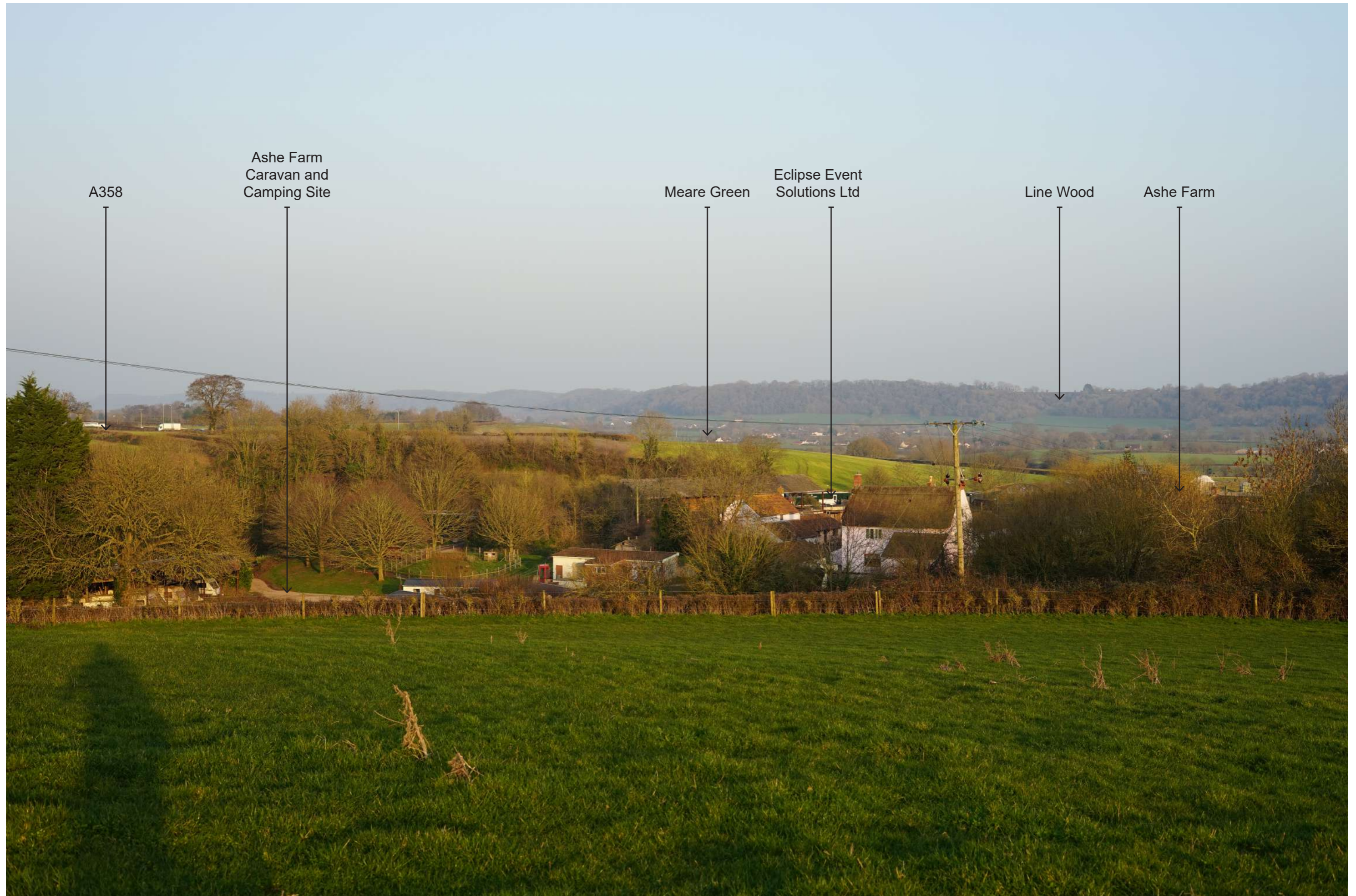
Photograph 7.3 Winter | Viewing distance at A3: 542mm | Horizontal field of view: 39.6° | Direction of view: East Camera: Sony ILCE-7 FFS | Lens: Sony FE 50mm F1.8 | Camera height: 1.5m AGL | Date taken: 01/03/2021 | Aperture: 7.1 | ISO speed: 100 | Shutter: 1/100 sec