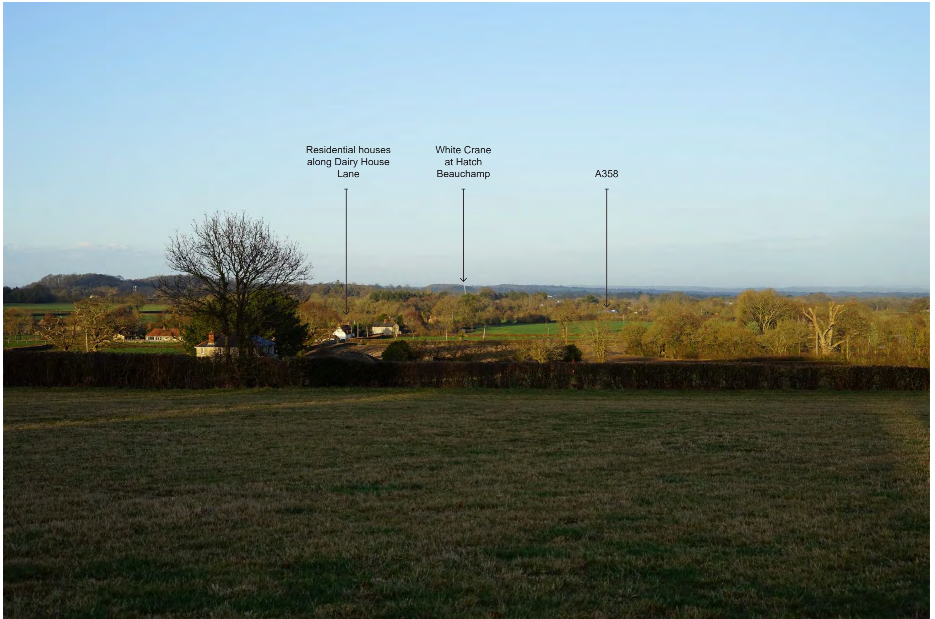
Photograph 16.1 Winter | Viewing distance at A3: 542mm | Horizontal field of view: 39.6° | Direction of view: North-east Camera: Sony ILCE-7 FFS | Lens: Sony FE 50mm F1.8 | Camera height: 1.5m AGL | Date taken: 25/02/2021 | Aperture: 7.1 | ISO speed: 100 | Shutter: 1/100 sec