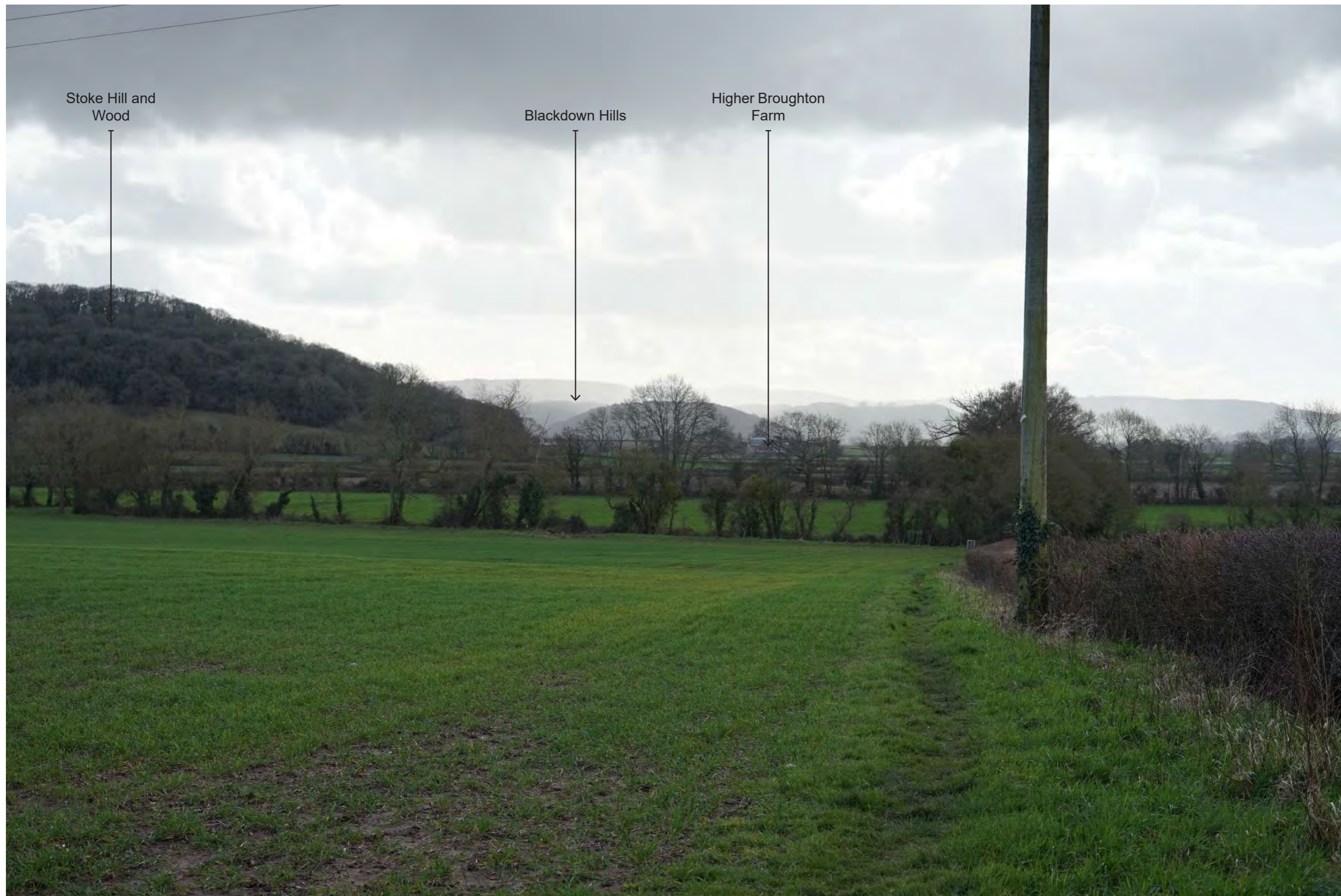
Photograph 4.1 Winter | Viewing distance at A3: 542mm | Horizontal field of view: 39.6° | Direction of view: South-west Camera: Sony ILCE-7 FFS | Lens: Sony FE 50mm F1.8 | Camera height: 1.5m AGL | Date taken: 25/02/2021 | Aperture: 8.0 | ISO speed: 100 | Shutter: 1/250 sec