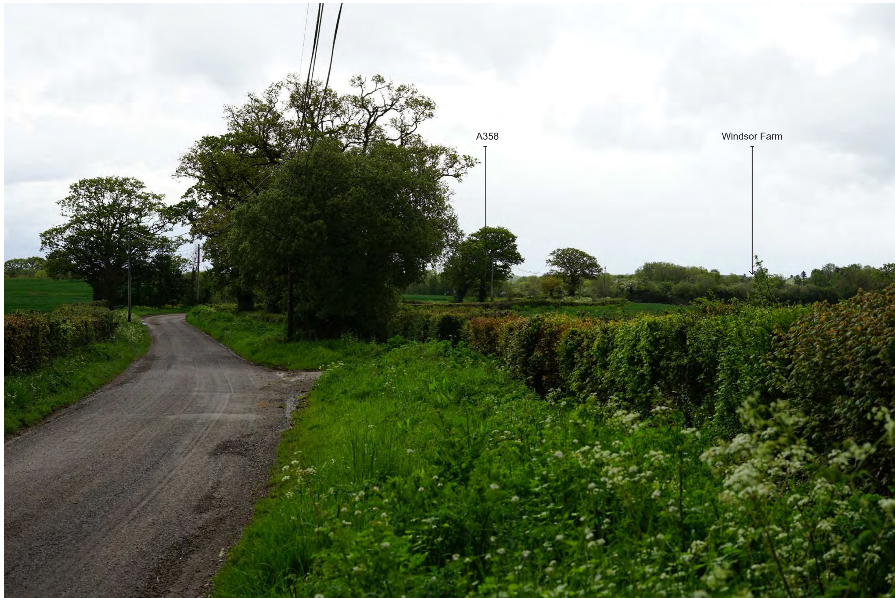
Photograph 15.2 Summer | Viewing distance at A3: 542mm | Horizontal field of view: 39.6° | Direction of view: East Camera: Sony ILCE-7 FFS | Lens: Sony FE 50mm F1.8 | Camera height: 1.5m AGL | Date taken: 18/05/2021 | Aperture: 8.0 | ISO speed: 100 | Shutter: 1/125 sec