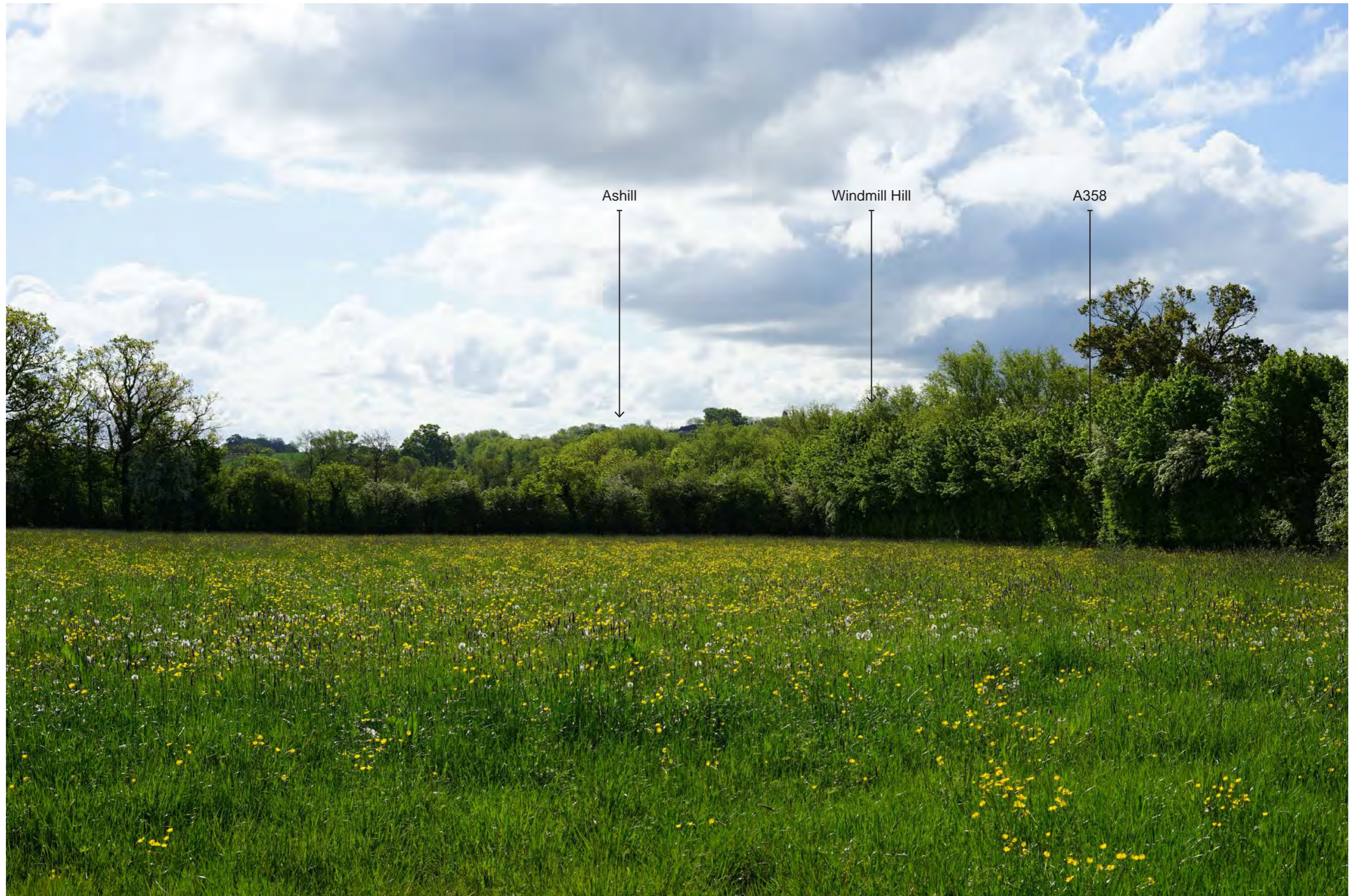
Photograph 18.2 Summer | Viewing distance at A3: 542mm | Horizontal field of view: 39.6° | Direction of view: South-east Camera: Sony ILCE-7 FFS | Lens: Sony FE 50mm F1.8 | Camera height: 1.5m AGL | Date taken: 19/05/2021 | Aperture: 10.0 | ISO speed: 100 | Shutter: 1/200 sec