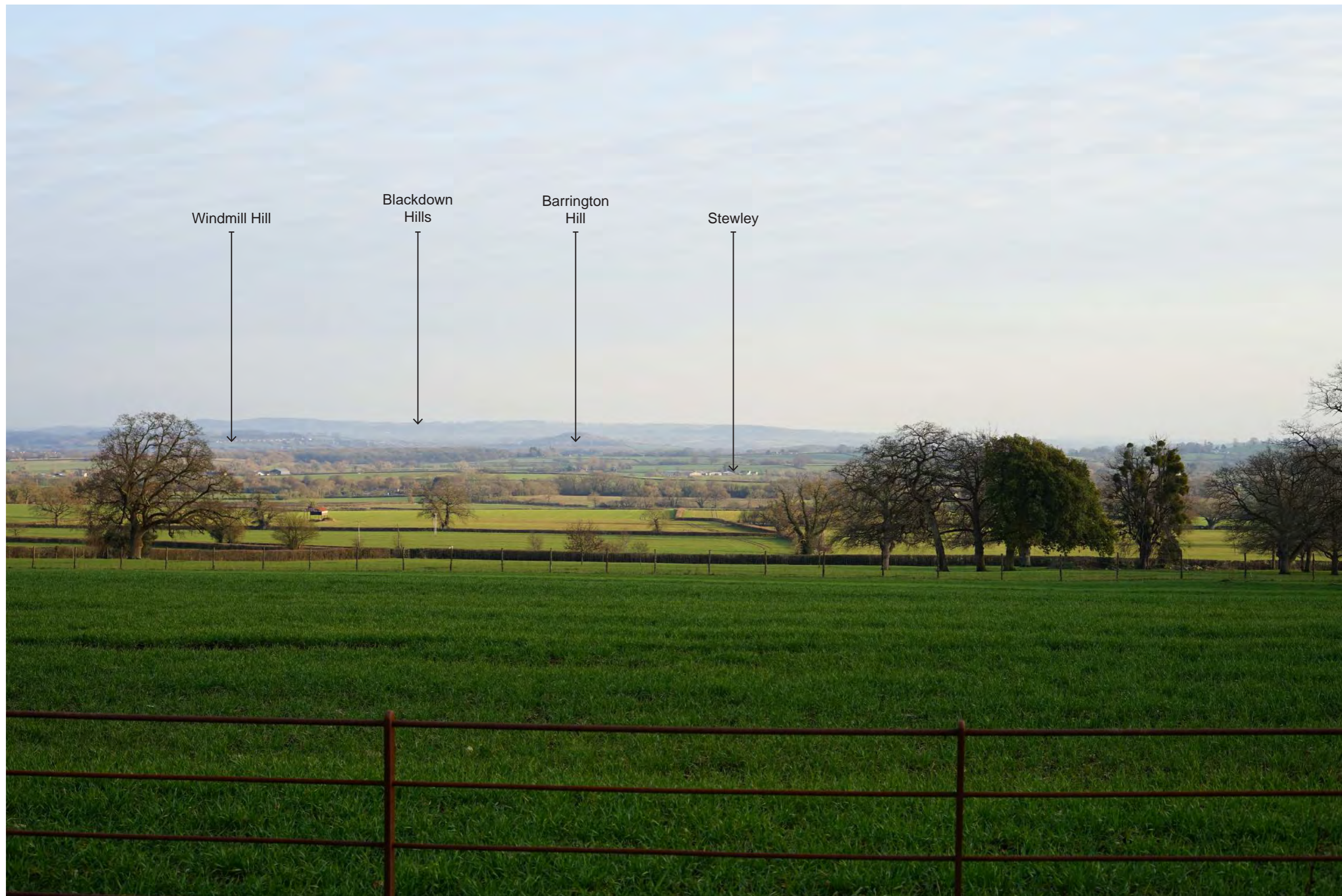
Photograph 12.1 Winter | Viewing distance at A3: 542mm | Horizontal field of view: 39.6° | Direction of view: South-east Camera: Sony ILCE-7 FFS | Lens: Sony FE 50mm F1.8 | Camera height: 1.5m AGL | Date taken: 08/03/2021 | Aperture: 6.3 | ISO speed: 100 | Shutter: 1/100 sec