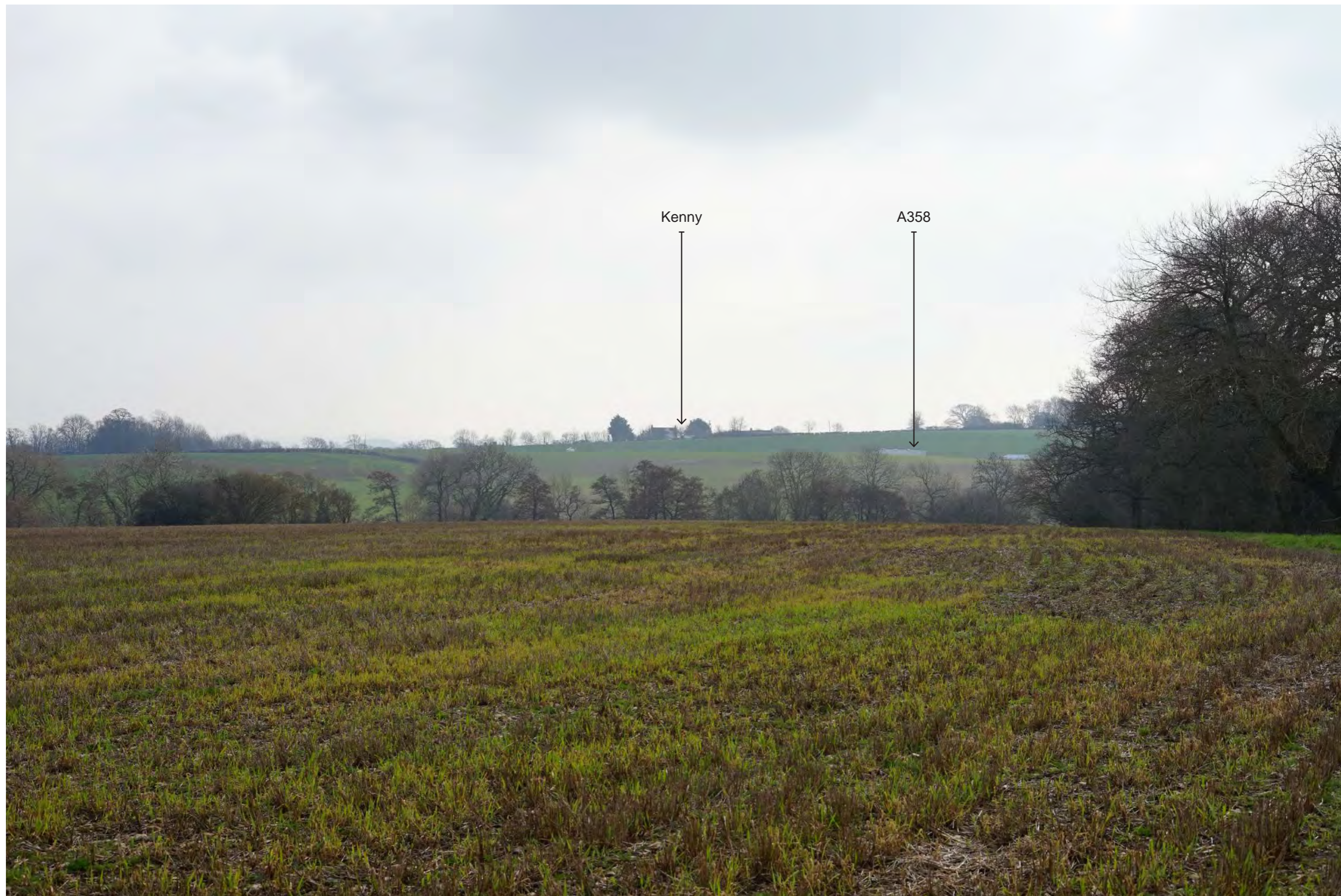
Photograph 20.1 Winter | Viewing distance at A3: 542mm | Horizontal field of view: 39.6° | Direction of view: Sout-west Camera: Sony ILCE-7 FFS | Lens: Sony FE 50mm F1.8 | Camera height: 1.5m AGL | Date taken: 01/03/2021 | Aperture: 10.0 | ISO speed: 100 | Shutter: 1/160 sec