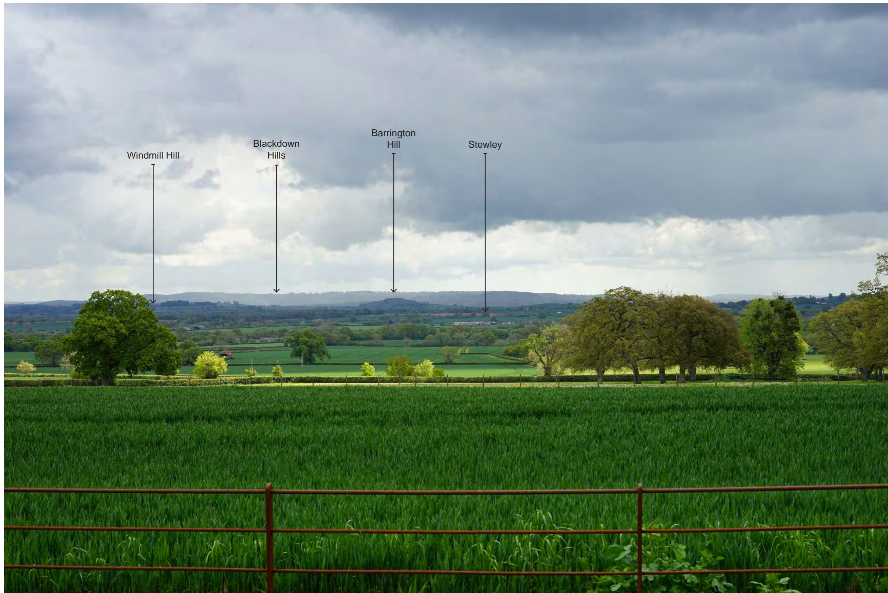
Photograph 12.2 Summer | Viewing distance at A3: 542mm | Horizontal field of view: 39.6° | Direction of view: South-east Camera: Sony ILCE-7 FFS | Lens: Sony FE 50mm F1.8 | Camera height: 1.5m AGL | Date taken: 17/05/2021 | Aperture: 8.0 | ISO speed: 100 | Shutter: 1/125 sec