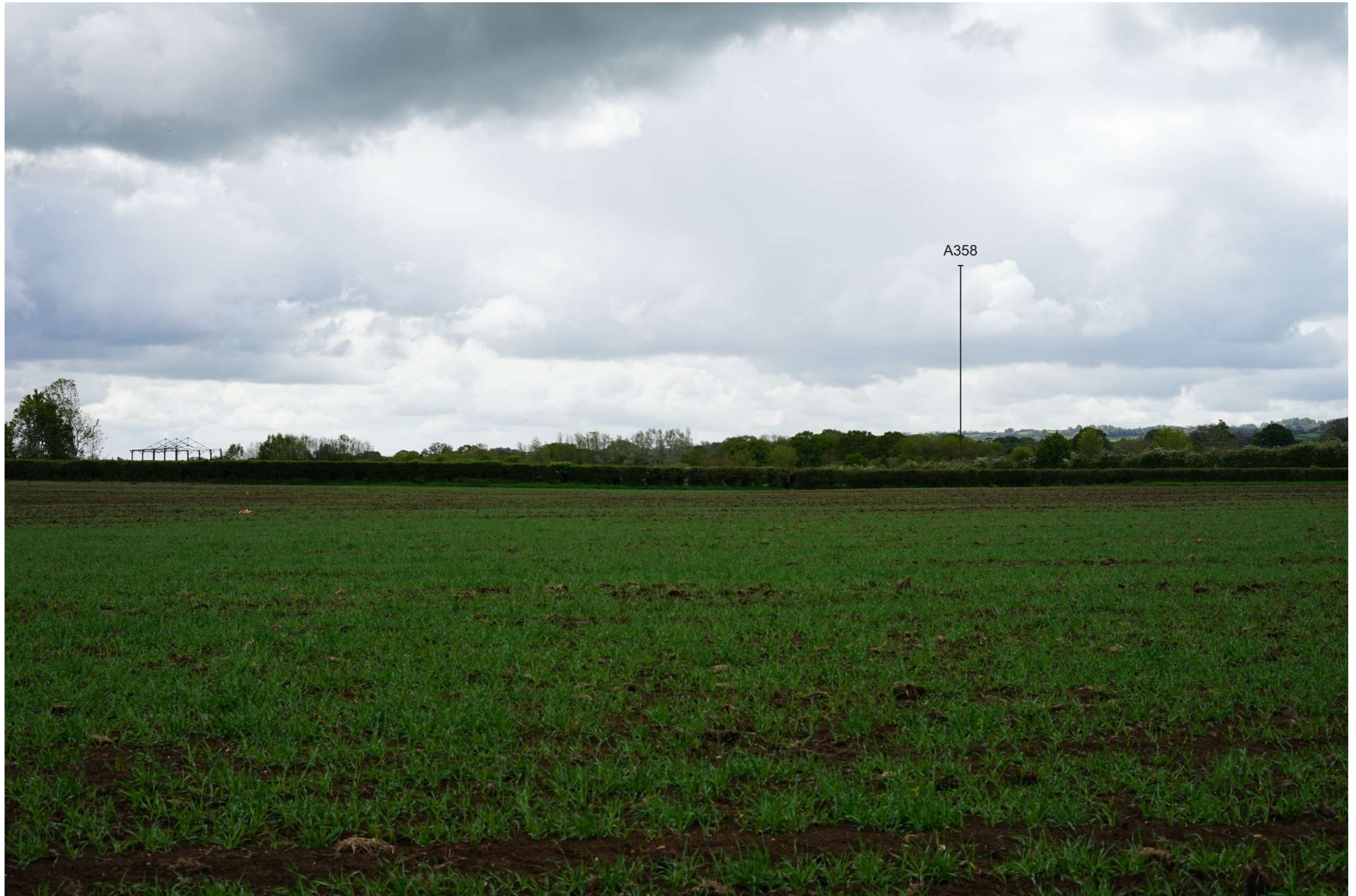
Photograph 13.2 Summer | Viewing distance at A3: 542mm | Horizontal field of view: 39.6° | Direction of view: South Camera: Sony ILCE-7 FFS | Lens: Sony FE 50mm F1.8 | Camera height: 1.5m AGL | Date taken: 17/05/2021 | Aperture: 9.0 | ISO speed: 100 | Shutter: 1/125 sec