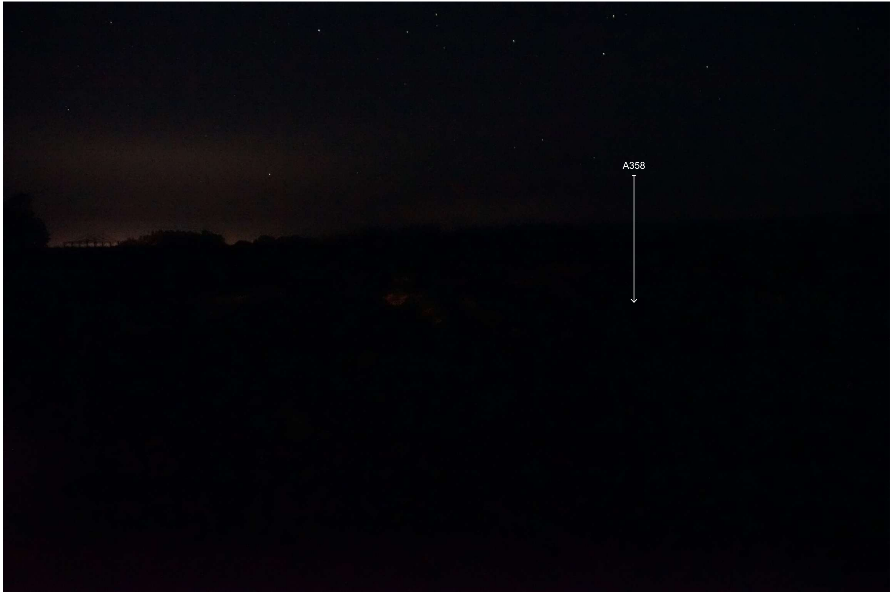
Photograph 13.3 Summer night | Viewing distance at A3: 542mm | Horizontal field of view: 39.6° | Direction of view: South Camera: Sony ILCE-7 FFS | Lens: Sony FE 50mm F1.8 | Camera height: 1.5m AGL | Date taken: 08/06/2021 | Aperture: 2.8 | ISO speed: 16000 | Shutter: 10/25 sec