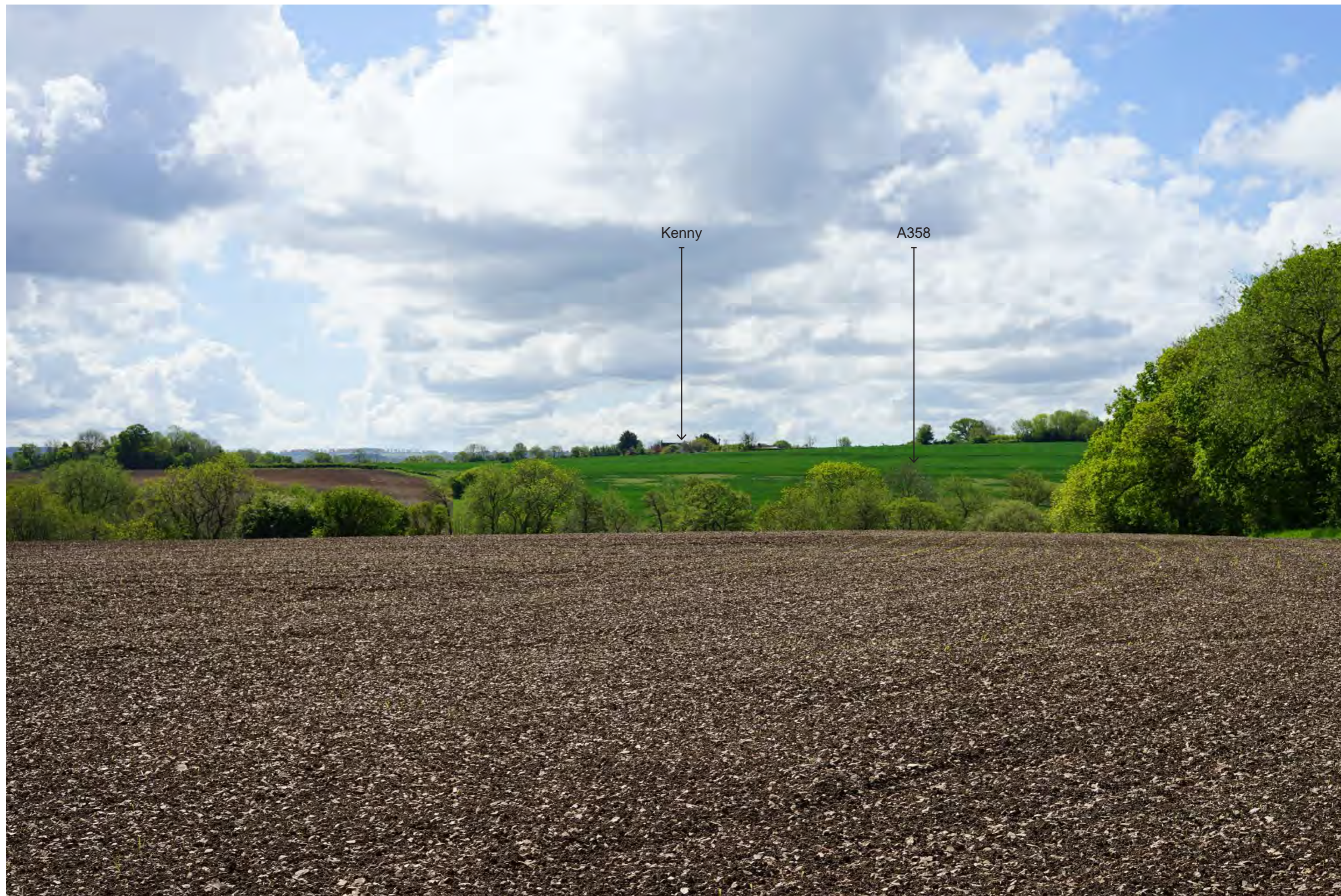
Photograph 20.2 Summer | Viewing distance at A3: 542mm | Horizontal field of view: 39.6° | Direction of view: Sout-west Camera: Sony ILCE-7 FFS | Lens: Sony FE 50mm F1.8 | Camera height: 1.5m AGL | Date taken: 19/05/2021 | Aperture: 10.0 | ISO speed: 100 | Shutter: 1/200 sec