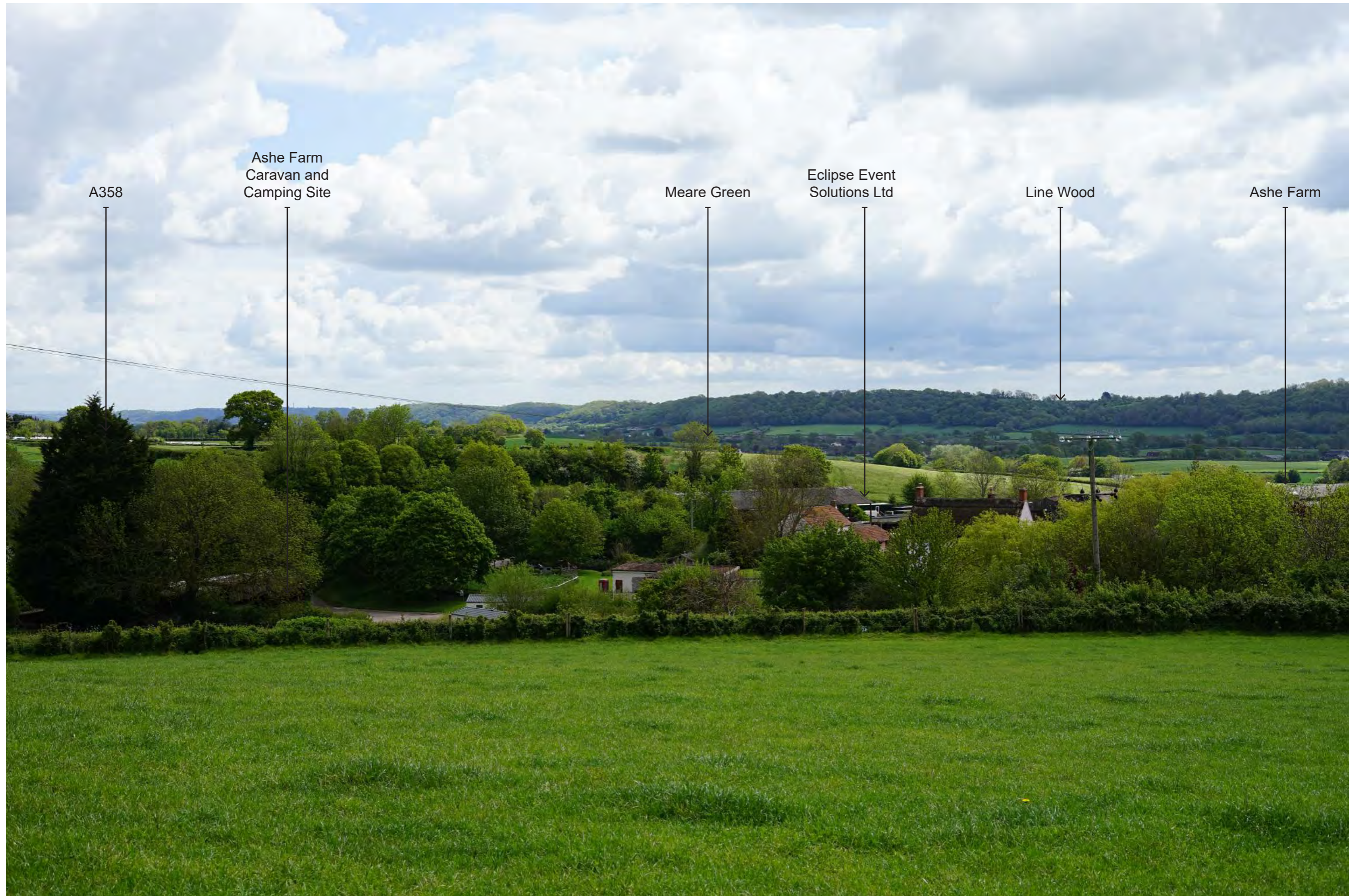
Photograph 7.4 Summer | Viewing distance at A3: 542mm | Horizontal field of view: 39.6° | Direction of view: East Camera: Sony ILCE-7 FFS | Lens: Sony FE 50mm F1.8 | Camera height: 1.5m AGL | Date taken: 17/05/2021 | Aperture: 10.0 | ISO speed: 100 | Shutter: 1/160 sec