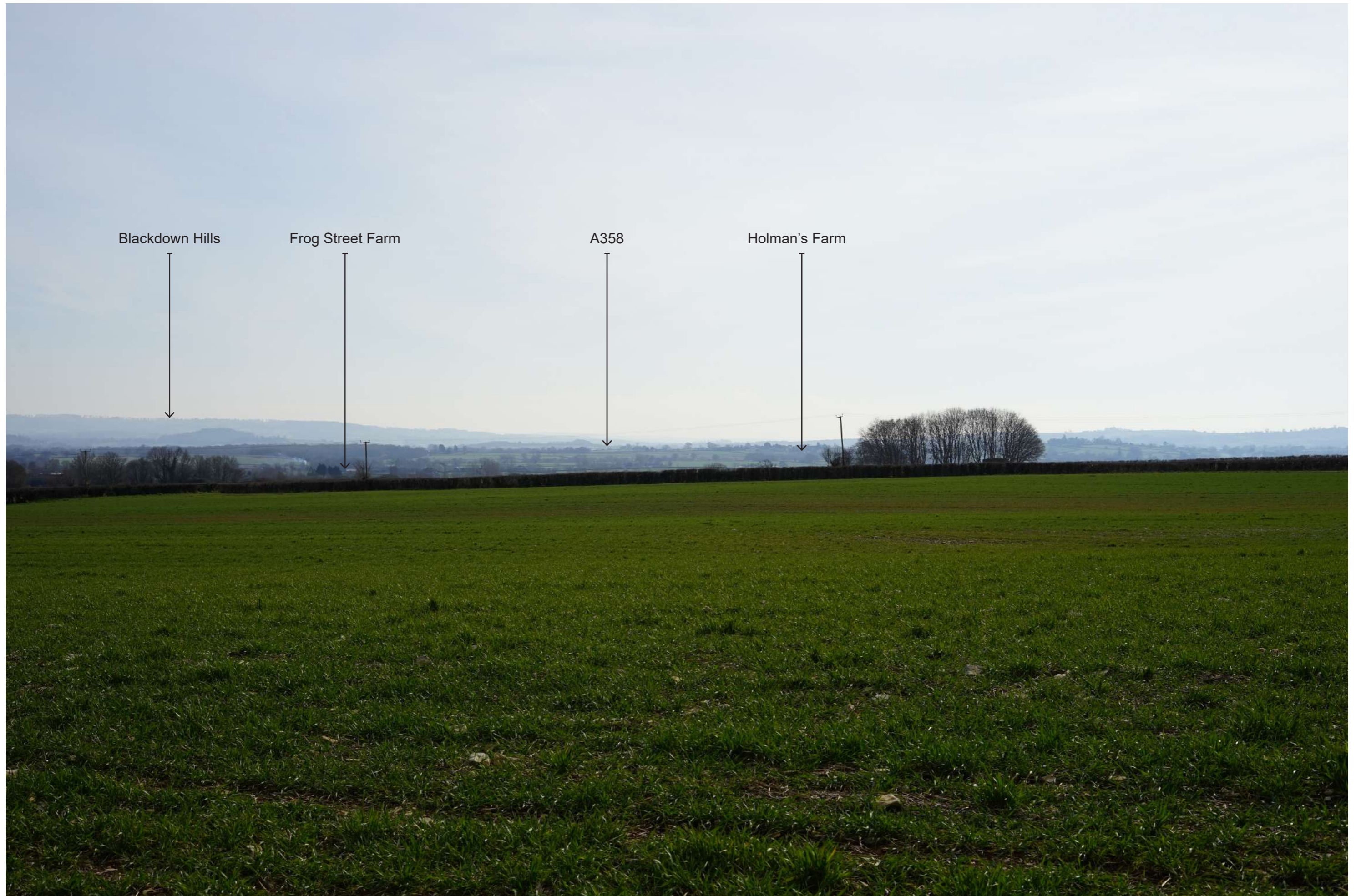
Photograph 17.1 Winter | Viewing distance at A3: 542mm | Horizontal field of view: 39.6° | Direction of view: South Camera: Sony ILCE-7 FFS | Lens: Sony FE 50mm F1.8 | Camera height: 1.5m AGL | Date taken: 09/03/2021 | Aperture: 10.0 | ISO speed: 100 | Shutter: 1/250 sec