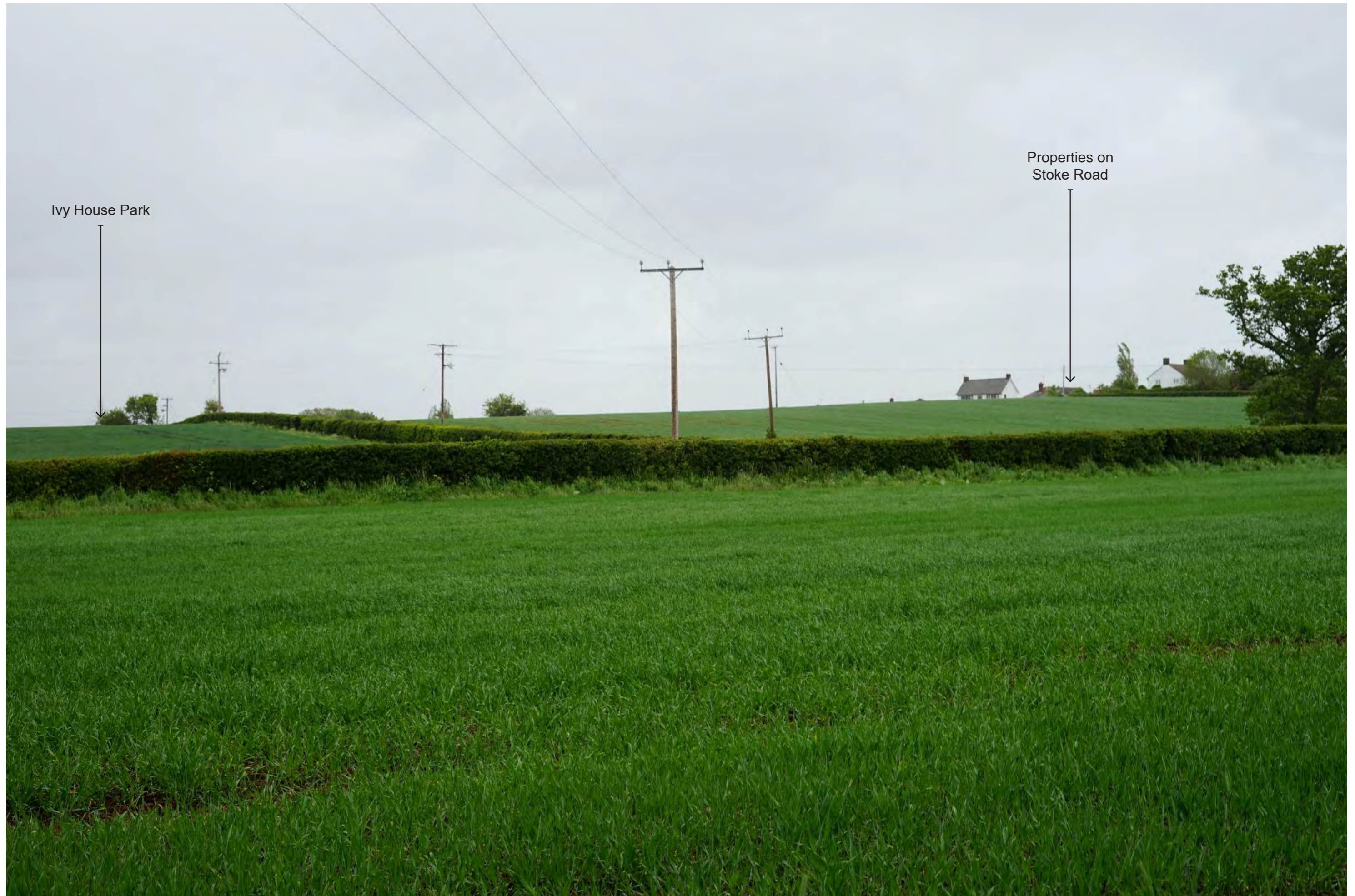
Photograph 1.2 Summer | Viewing distance at A3: 542mm | Horizontal field of view: 39.6° | Direction of view: North-east Camera: Sony ILCE-7 FFS | Lens: Sony FE 50mm F1.8 | Camera height: 1.5m AGL | Date taken: 20/05/2021 | Aperture: 8.0 | ISO speed: 100 | Shutter: 1/125 sec