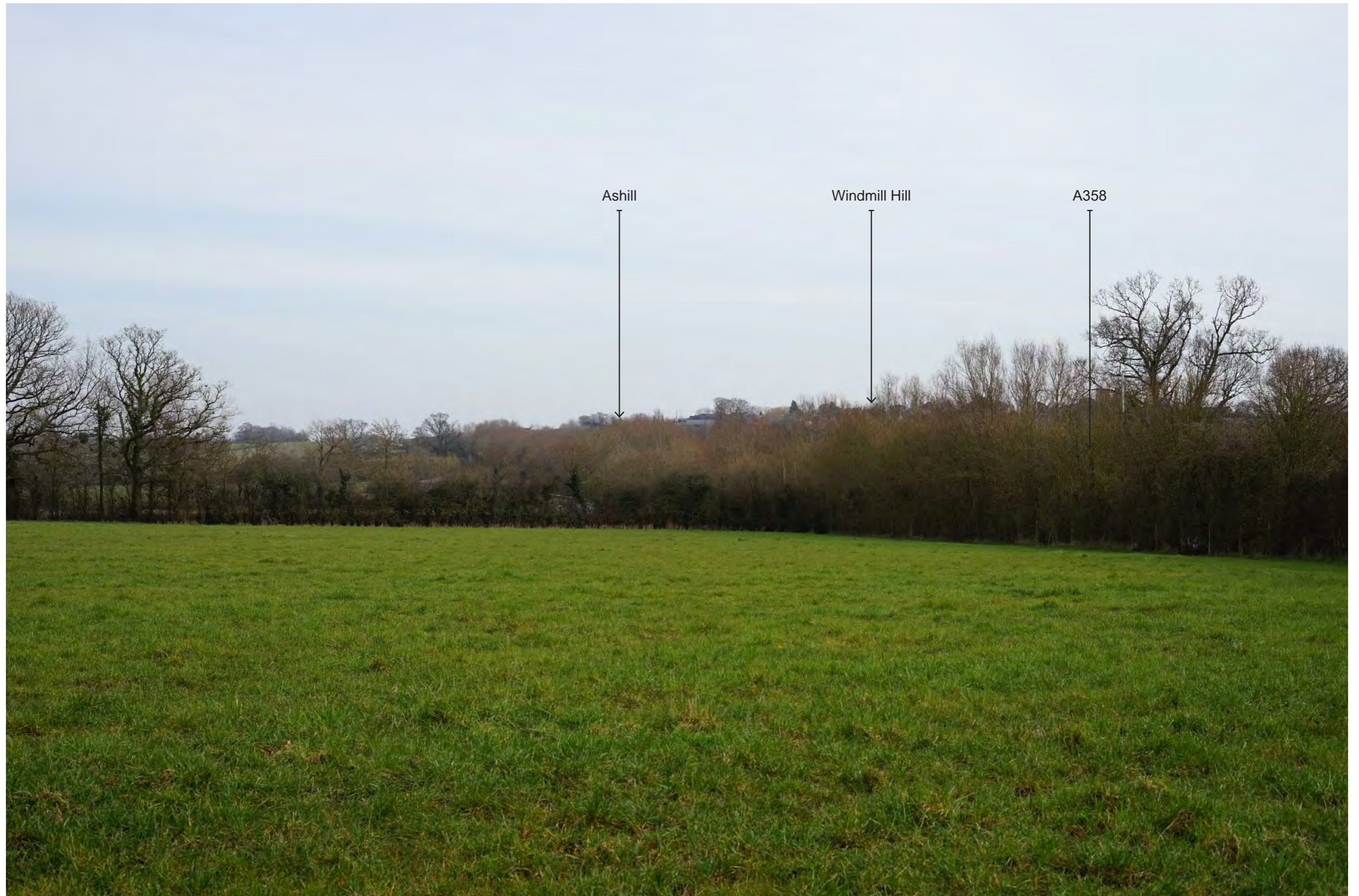
Photograph 18.1 Winter | Viewing distance at A3: 542mm | Horizontal field of view: 39.6° | Direction of view: South-east Camera: Sony ILCE-7 FFS | Lens: Sony FE 50mm F1.8 | Camera height: 1.5m AGL | Date taken: 09/03/2021 | Aperture: 9.0 | ISO speed: 100 | Shutter: 1/125 sec