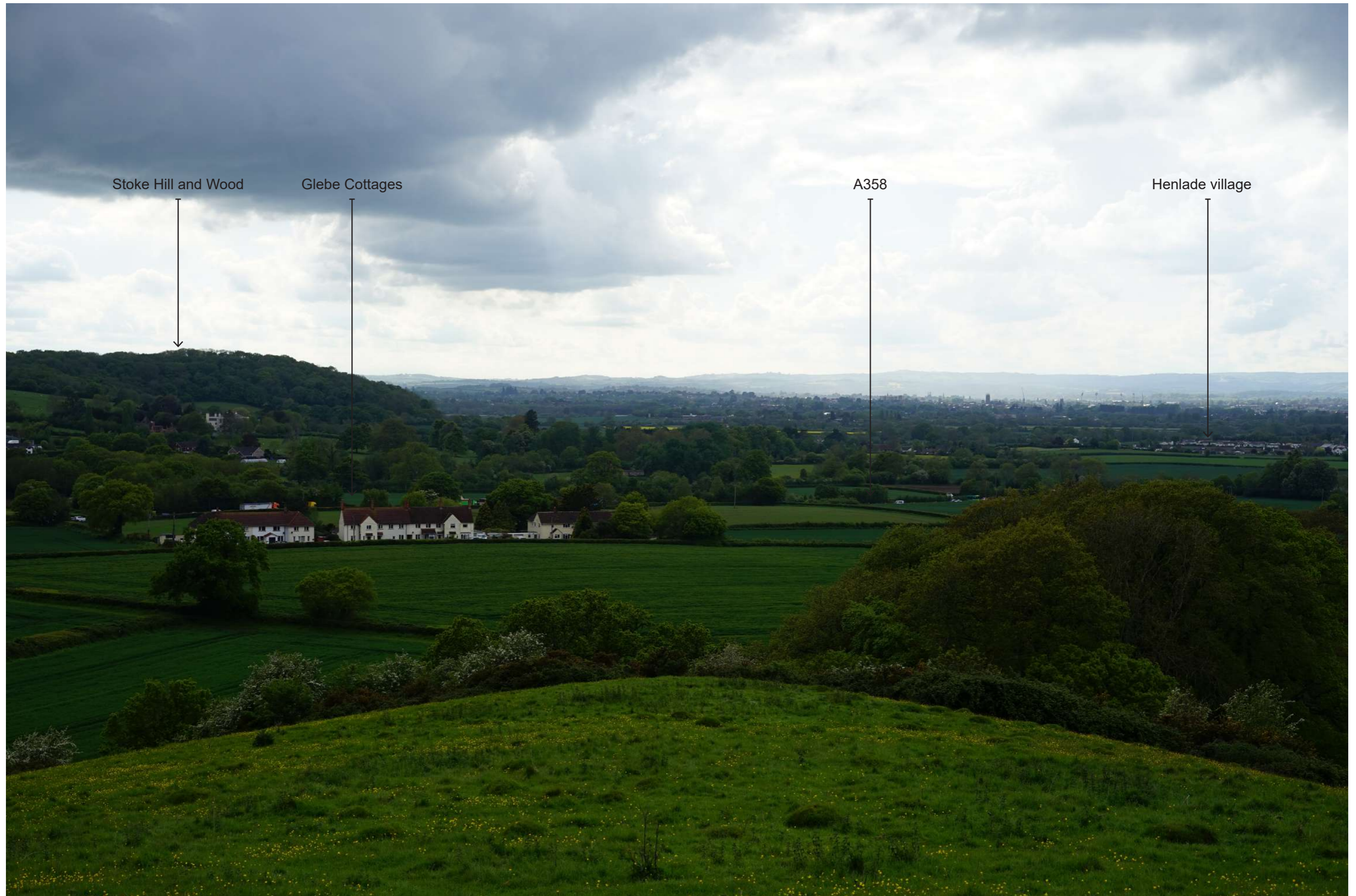
Photograph 5.2 Summer | Viewing distance at A3: 542mm | Horizontal field of view: 39.6° | Direction of view: West Camera: Sony ILCE-7 FFS | Lens: Sony FE 50mm F1.8 | Camera height: 1.5m AGL | Date taken: 17/05/2021 | Aperture: 9.0 | ISO speed: 100 | Shutter: 1/125 sec