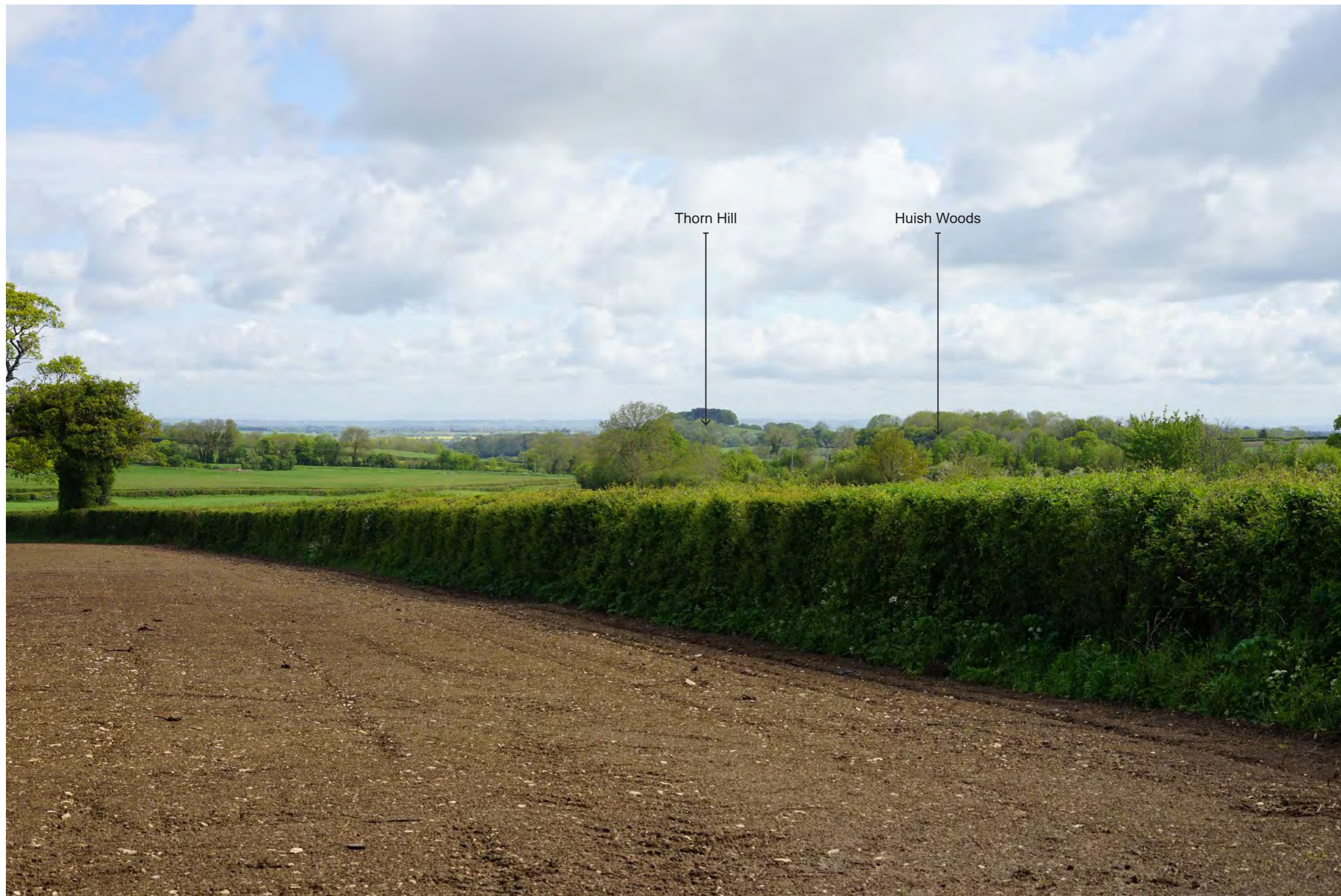
Photograph 11.2 Summer | Viewing distance at A3: 542mm | Horizontal field of view: 39.6° | Direction of view: North-east Camera: Sony ILCE-7 FFS | Lens: Sony FE 50mm F1.8 | Camera height: 1.5m AGL | Date taken: 17/05/2021 | Aperture: 9.0 | ISO speed: 100 | Shutter: 1/125 sec