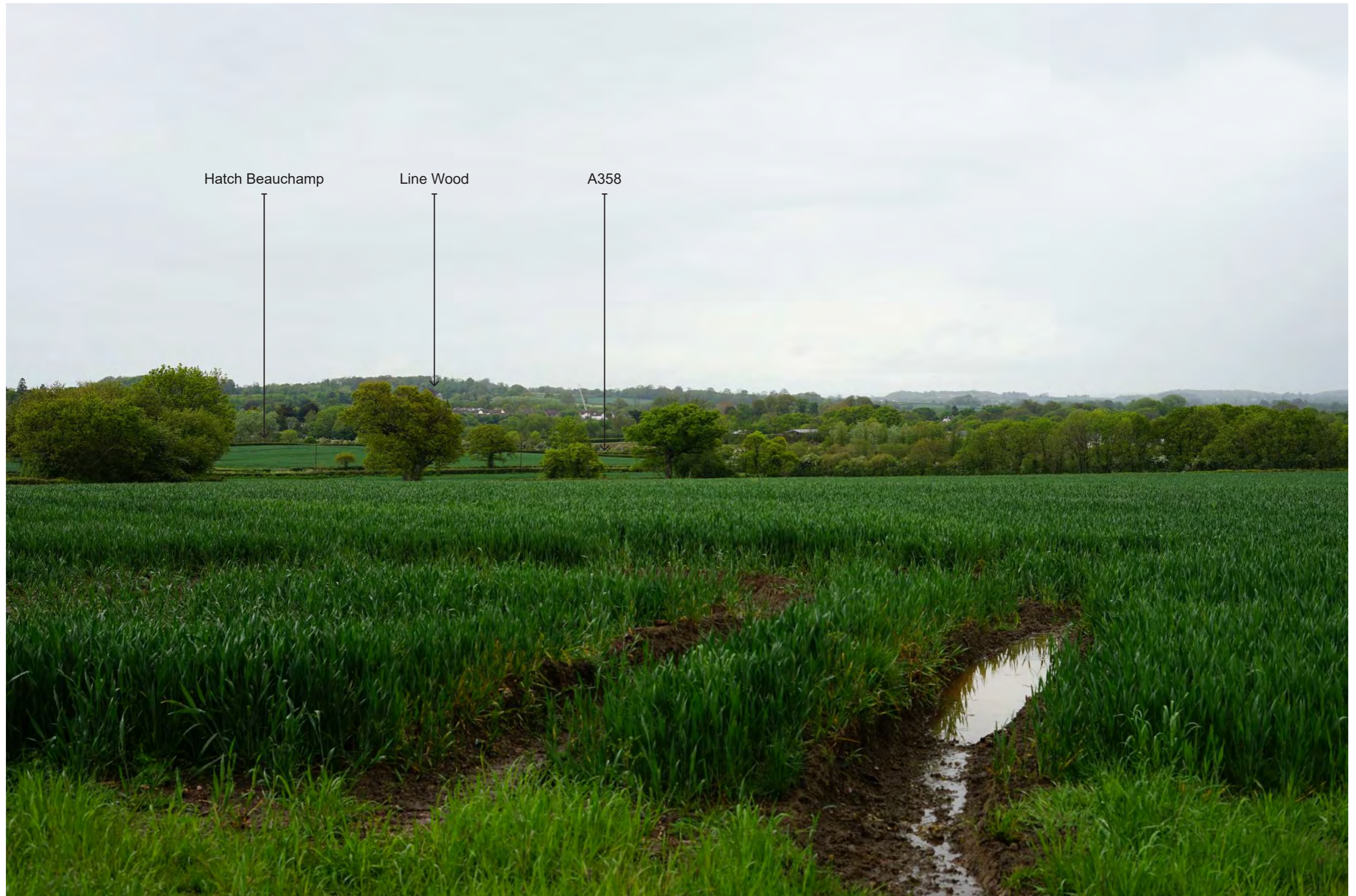
Photograph 19.2 Summer | Viewing distance at A3: 542mm | Horizontal field of view: 39.6° | Direction of view: North-east Camera: Sony ILCE-7 FFS | Lens: Sony FE 50mm F1.8 | Camera height: 1.5m AGL | Date taken: 02/03/2021 | Aperture: 9.0 | ISO speed: 100 | Shutter: 1/125 sec