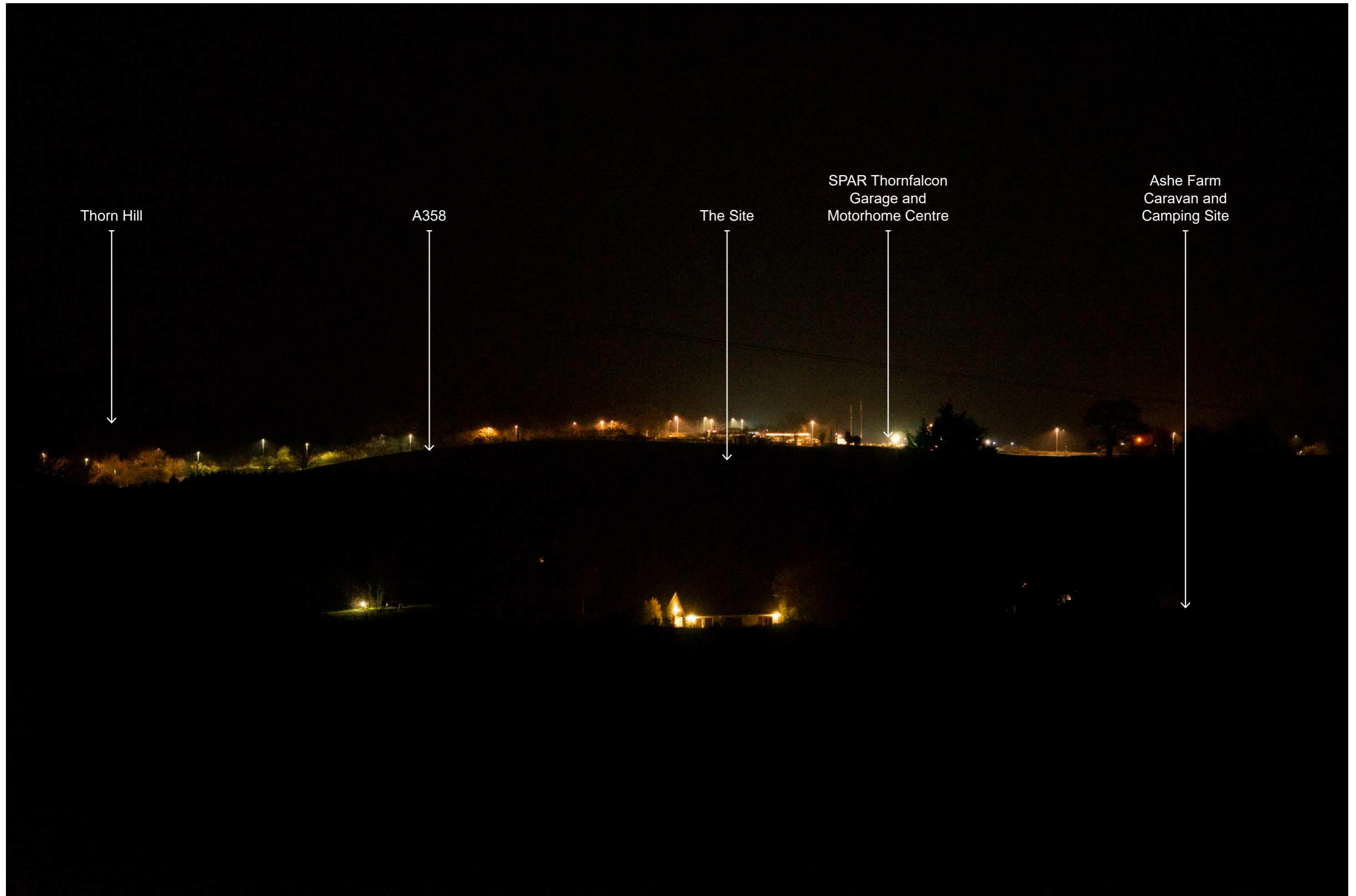
Photograph 7.5 Winter night | Viewing distance at A3: 542mm | Horizontal field of view: 39.6° | Direction of view: North-east Camera: Sony ILCE-7 FFS | Lens: Sony FE 50mm F1.8 | Camera height: 1.5m AGL | Date taken: 02/03/2021 | Aperture: 2.8 | ISO speed: 1600 | Shutter: 1/10 sec