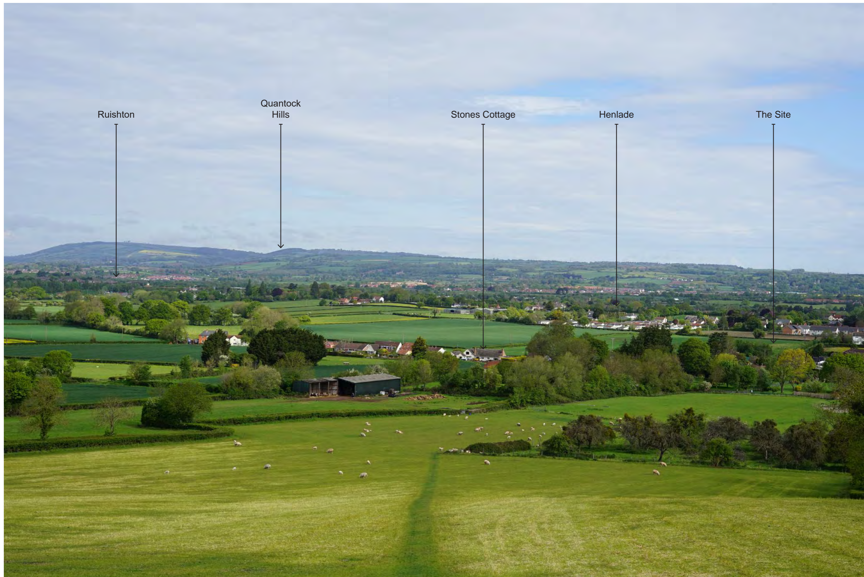
Photograph 2.2 Summer | Viewing distance at A3: 542mm | Horizontal field of view: 39.6° | Direction of view: North-west Camera: Sony ILCE-7 FFS | Lens: Sony FE 50mm F1.8 | Camera height: 1.5m AGL | Date taken: 17/05/2021 | Aperture: 10.0 | ISO speed: 100 | Shutter: 1/160 sec