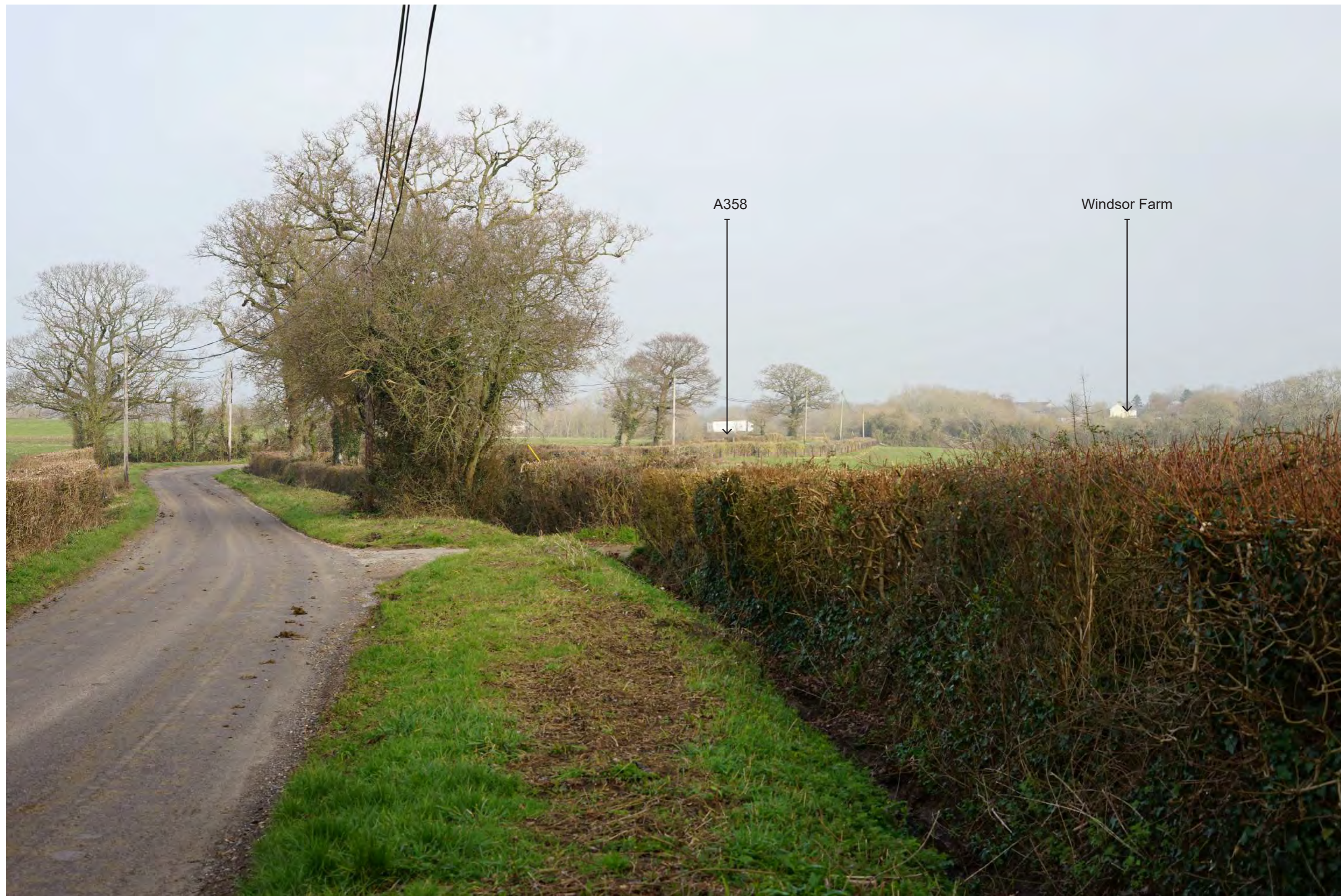
Photograph 15.1 Winter | Viewing distance at A3: 542mm | Horizontal field of view: 39.6° | Direction of view: East Camera: Sony ILCE-7 FFS | Lens: Sony FE 50mm F1.8 | Camera height: 1.5m AGL | Date taken: 02/03/2021 | Aperture: 7.1 | ISO speed: 100 | Shutter: 1/100 sec