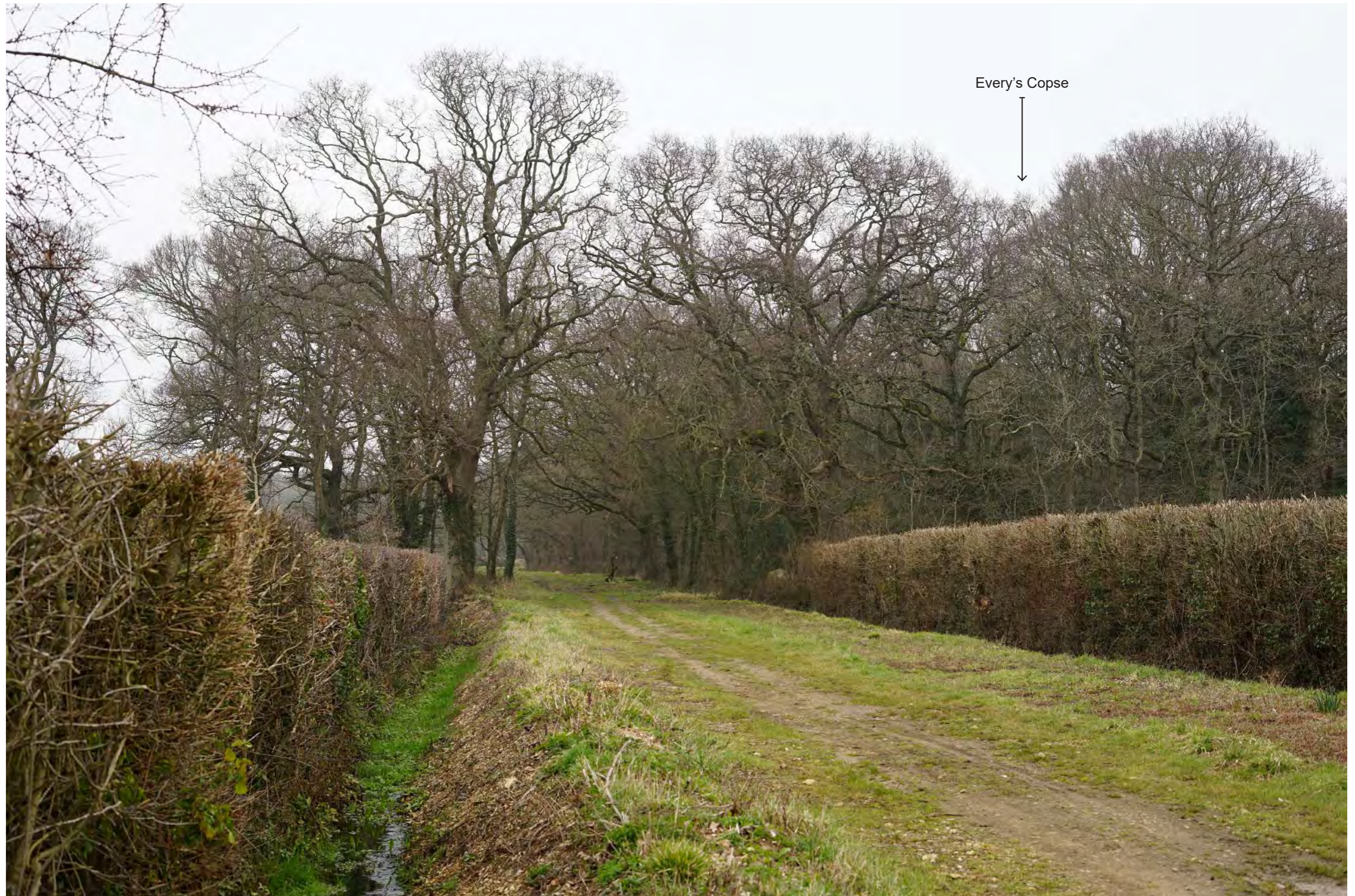
Photograph 22.2 Winter | Viewing distance at A3: 542mm | Horizontal field of view: 39.6° | Direction of view: North Camera: Sony ILCE-7 FFS | Lens: Sony FE 50mm F1.8 | Camera height: 1.5m AGL | Date taken: 02/03/2021 | Aperture: 6.3 | ISO speed: 100 | Shutter: 1/100 sec