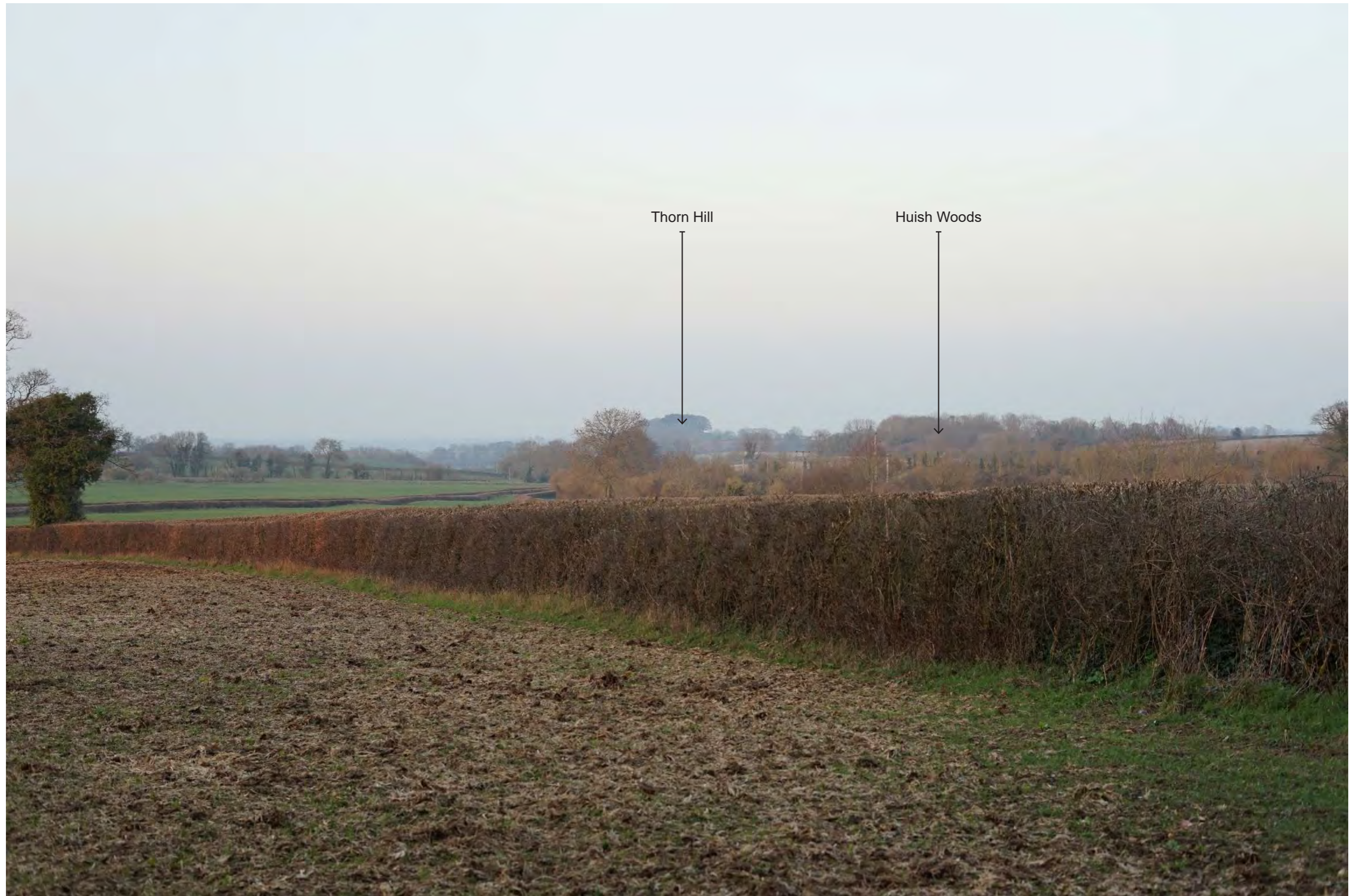
Photograph 11.1 Winter | Viewing distance at A3: 542mm | Horizontal field of view: 39.6° | Direction of view: North-east Camera: Sony ILCE-7 FFS | Lens: Sony FE 50mm F1.8 | Camera height: 1.5m AGL | Date taken: 01/03/2021 | Aperture: 4.0 | ISO speed: 100 | Shutter: 1/60 sec