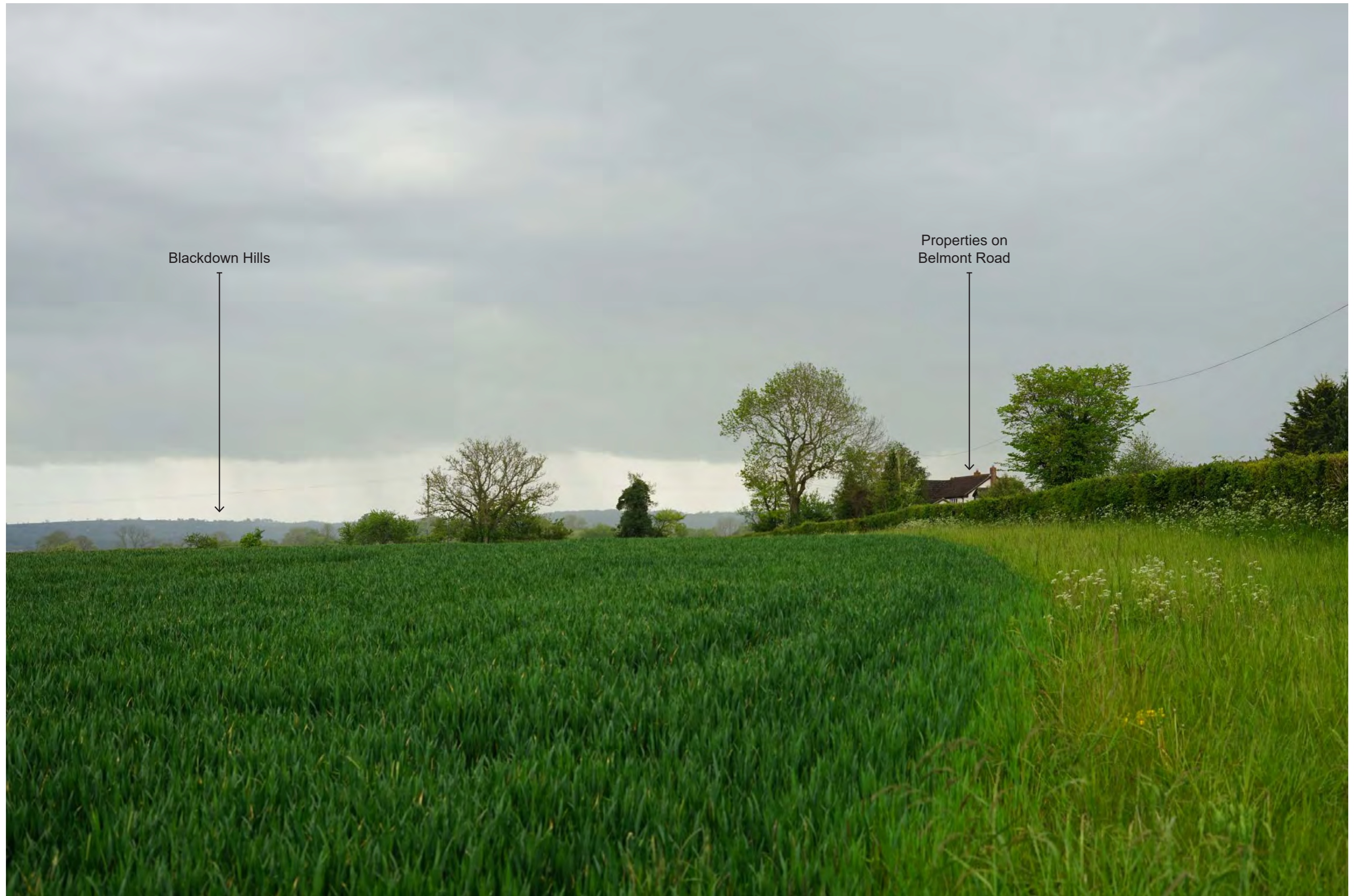
Photograph 17.2 Summer | Viewing distance at A3: 542mm | Horizontal field of view: 39.6° | Direction of view: South Camera: Sony ILCE-7 FFS | Lens: Sony FE 50mm F1.8 | Camera height: 1.5m AGL | Date taken: 17/05/2021 | Aperture: 6.3 | ISO speed: 100 | Shutter: 1/100 sec