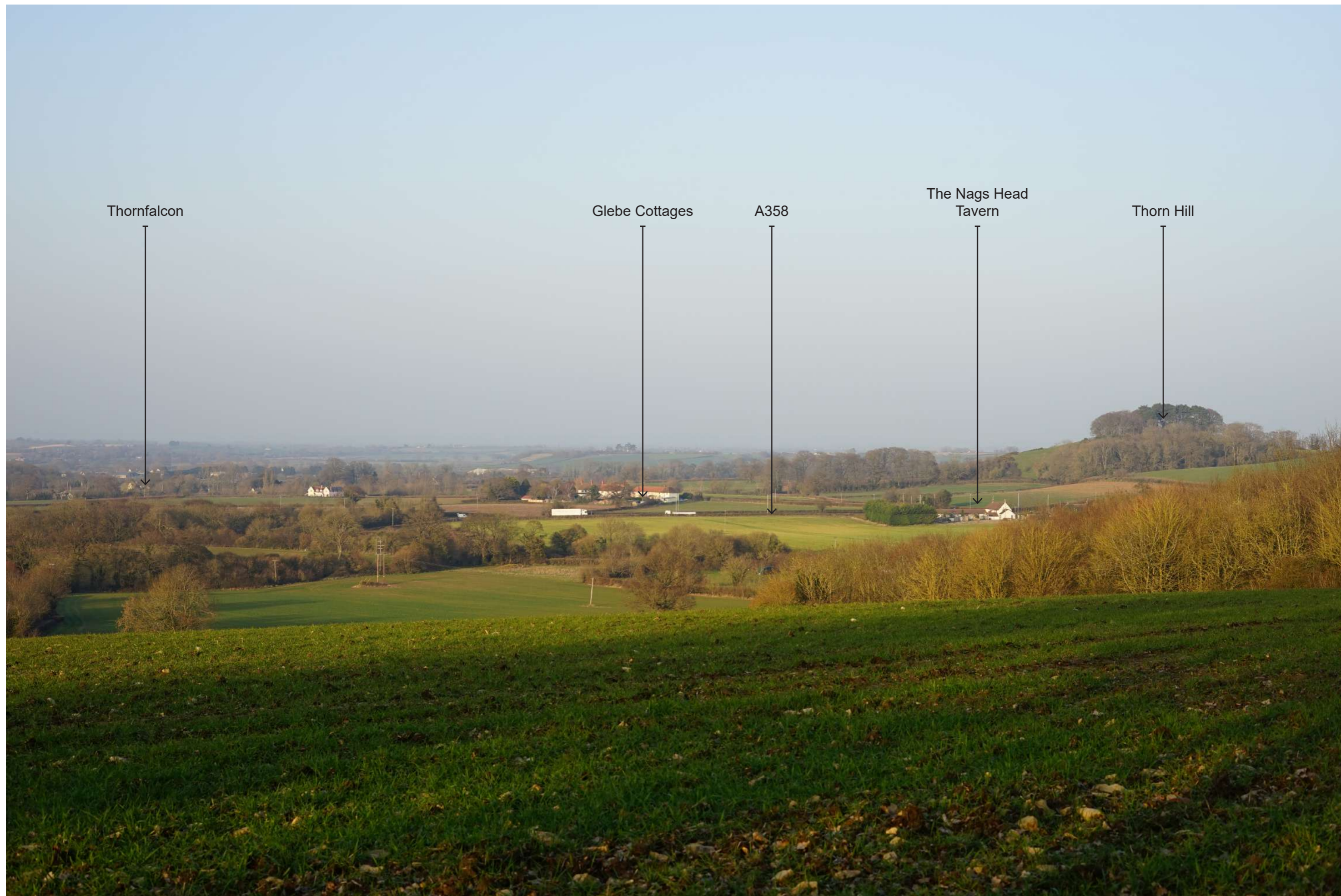
Photograph 6.1 Winter | Viewing distance at A3: 542mm | Horizontal field of view: 39.6° | Direction of view: North-east Camera: Sony ILCE-7 FFS | Lens: Sony FE 50mm F1.8 | Camera height: 1.5m AGL | Date taken: 01/03/2021 | Aperture: 7.1 | ISO speed: 100 | Shutter: 1/100 sec