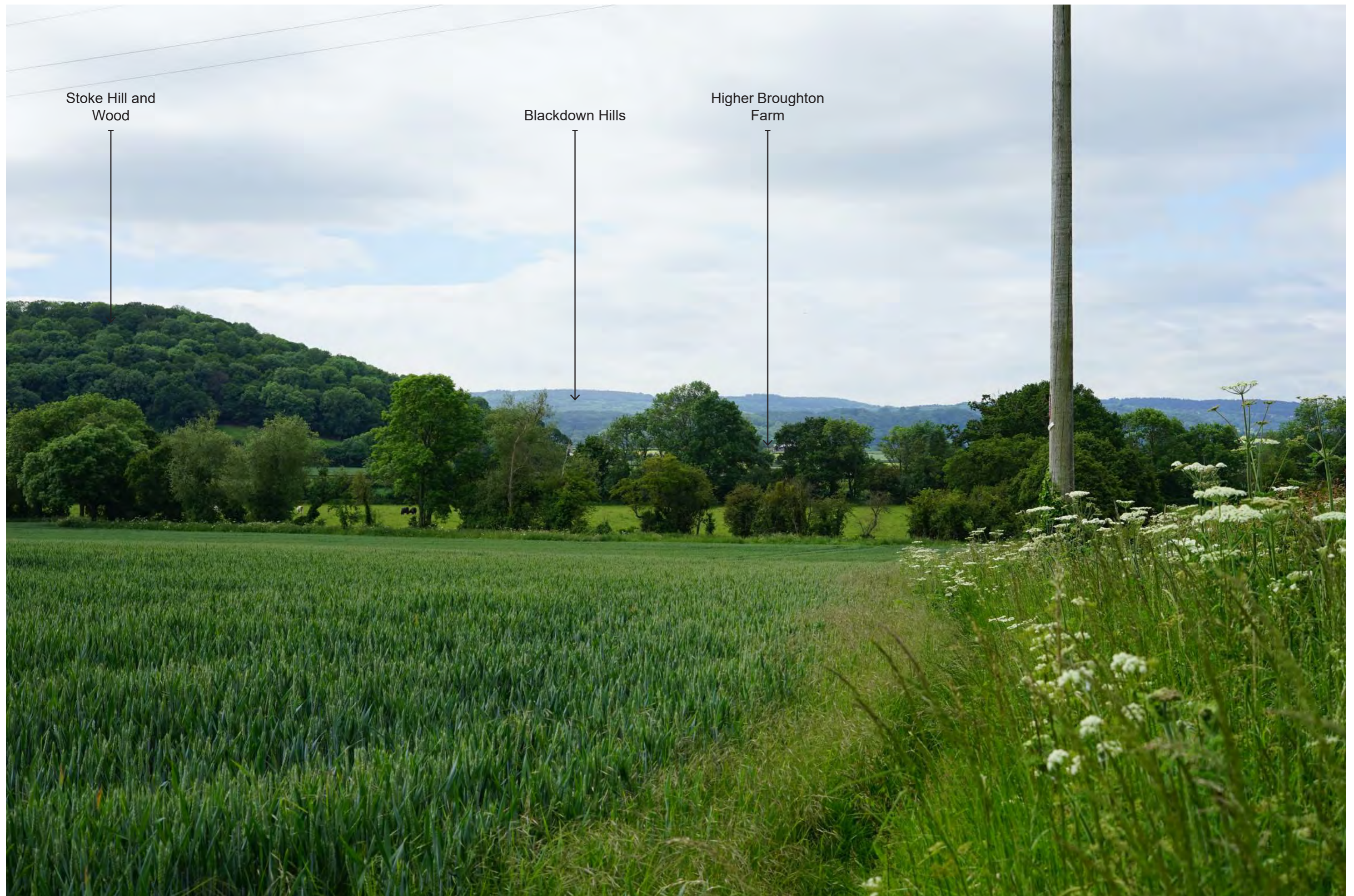
Photograph 4.2 Summer | Viewing distance at A3: 542mm | Horizontal field of view: 39.6° | Direction of view: South-west Camera: Sony ILCE-7 FFS | Lens: Sony FE 50mm F1.8 | Camera height: 1.5m AGL | Date taken: 09/06/2021 | Aperture: 9.0 | ISO speed: 100 | Shutter: 1/125 sec